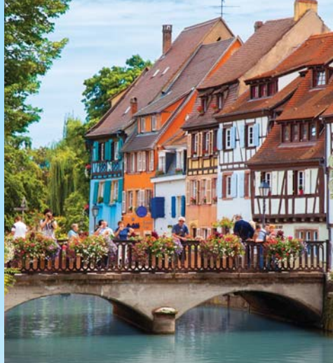
Half-timbered houses in Strasbourg's Petite-France quarter reflect the city's dual French and German character.

snow-crowned heights of the Alps to subtropical lowlands. Admire the impressive natural treasures of soaring, snowcapped mountain peaks, green, rolling hills, crystal-clear glacial lakes and densely wooded forests.