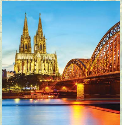
Towering spires crown Cologne's majestic Kölner Dom (cathedral), one of the finest Gothic structures ever built.

Following breakfast, disembark the ship and continue on the Amsterdam Post-Program or depart for the U.S.