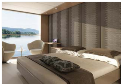
Cabin Category 2

The English-speaking, international crew provides warm hospitality. The M.S. AMADEUS SILVER III meets the highest safety standards and is part of the AMADEUS RIVER FLEET, the only European river fleet to have been awarded the "Green Certificate" of environmental preservation.