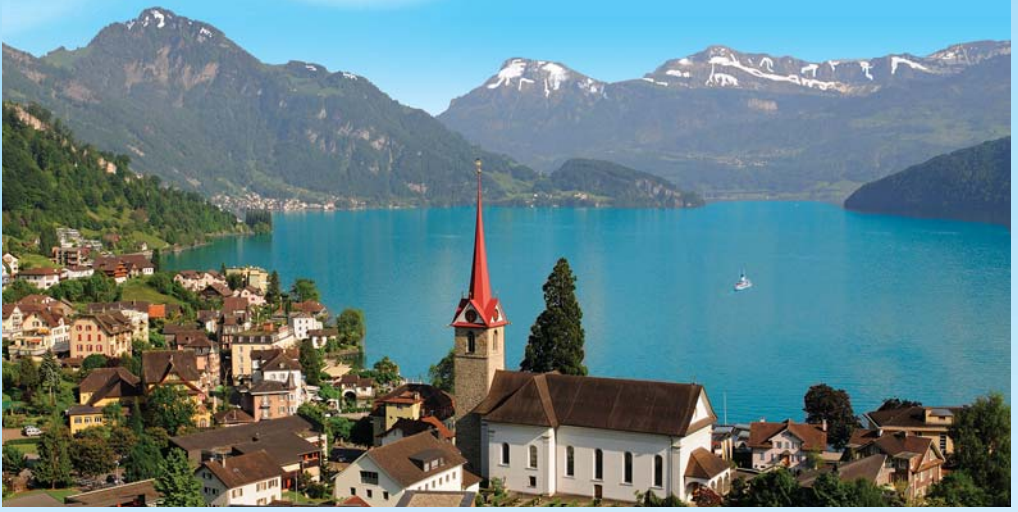
Cruise beautiful Lake Lucerne and enjoy picturesque views of its fjord-like landscape, Mounts Pilatus and Rigi in the distance and its four surrounding cantons of Lucerne, Schwyz, Unterwalden and Uri.

the famous Alte Brücke (Old Bridge) that span the Neckar River. Visit imposing Heidelberg Castle, a magnificent, 13 th -century edifice perched above the river. The stately ruins preserve Heidelberg's links to its medieval past.