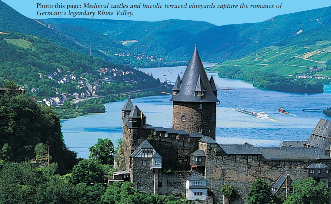
Photo this page: Medieval castles and bucolic terraced vineyards capture the romance of Germany's legendary Rhine Valley.

Cover photo: View the unforgettable peaks of the iconic Matterhorn from the top of the highest cog railway in Europe, the world-renowned Gornergrat Bahn.