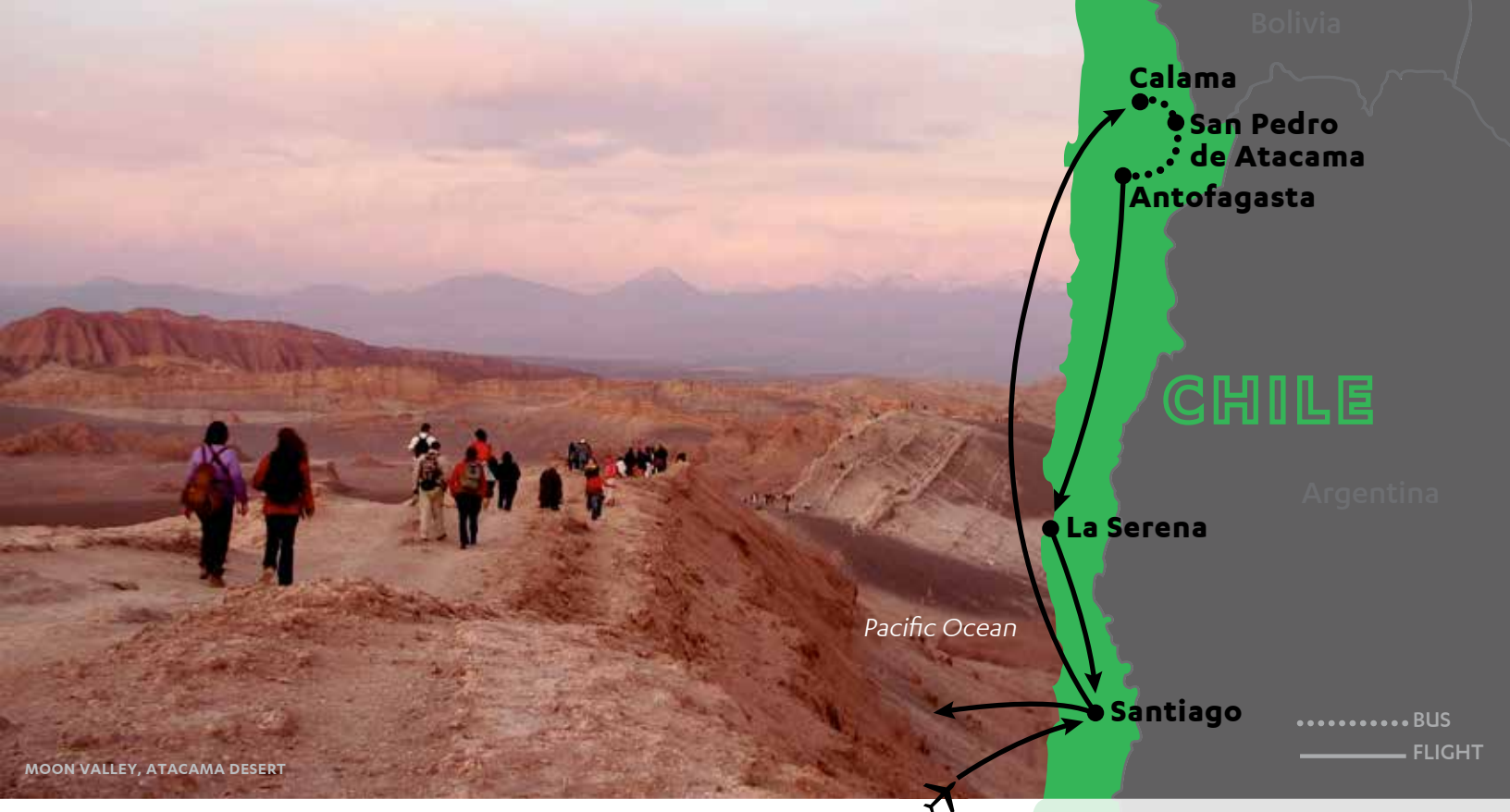
MOON VALLEY, ATACAMA DESERT