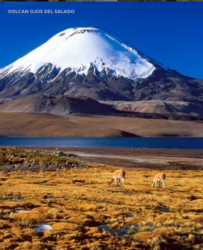
VOLCAN OJOS DEL SALADO

He is a planetary astronomer who conducts research on the properties of habitable worlds using a variety of spacecraft and telescopes, including the largest telescope on Earth at the Arecibo Observatory in Puerto Rico, the Very Large Telescope in Chile's Atacama Desert, and the Kepler space observatory. He leads a teaching and research program focused on the search for extraterrestrial intelligence (SETI) with UCLA undergraduate and graduate students.