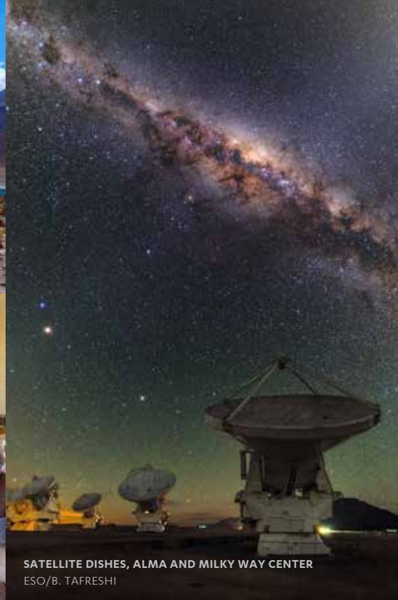
SATELLITE DISHES, ALMA AND MILKY WAY CENTER

described as the world's largest optical telescope. Located atop Cerro Paranal in the Atacama Desert , it has 4 telescopes of 8.2 meters in diameter. The Paranal Mountain was chosen because of its excellent atmospheric conditions and remote location. After touring the facilities, we'll transfer to the airport for late afternoon flight to La Serena.