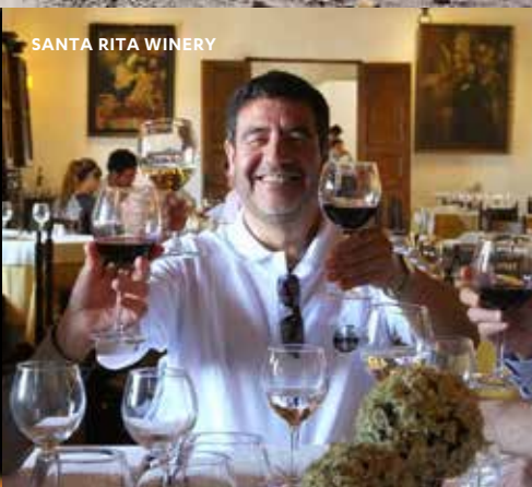
SANTA RITA WINERY