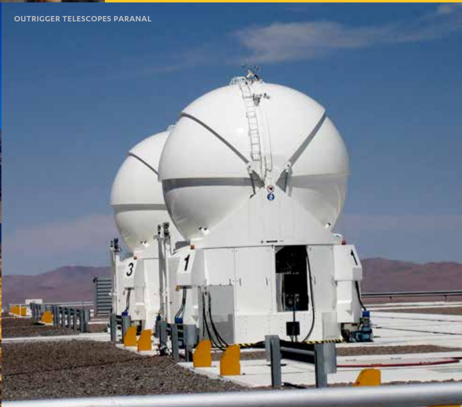
OUTRIGGER TELESCOPES PARANAL