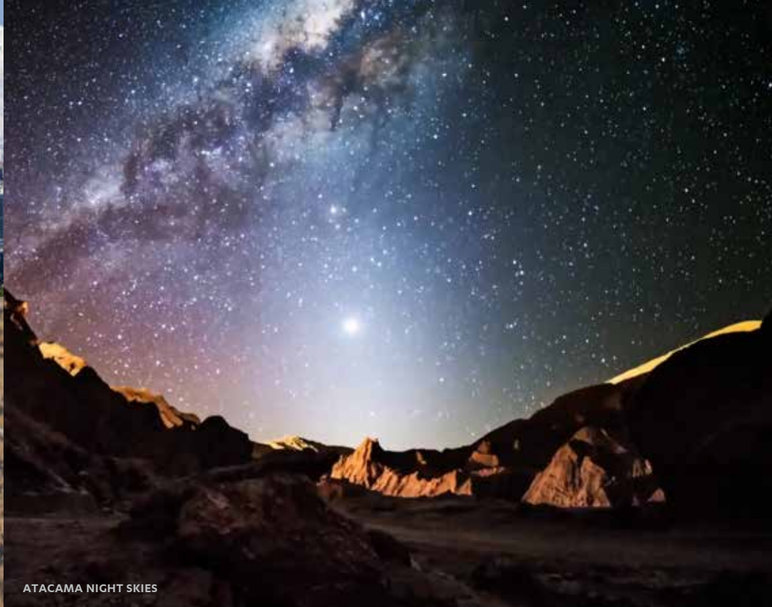
ATACAMA NIGHT SKIES