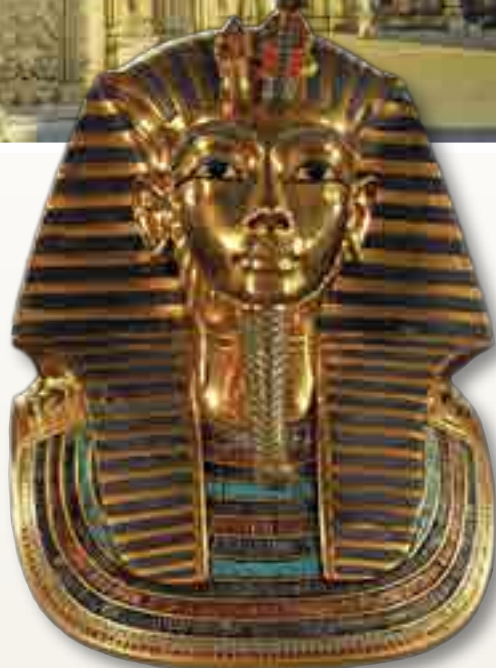
Top: Mosque of Mohammed Ali, Cairo | Above: Burial mask of Tutankhamen

Discovery: The Pyramids of Giza. View the