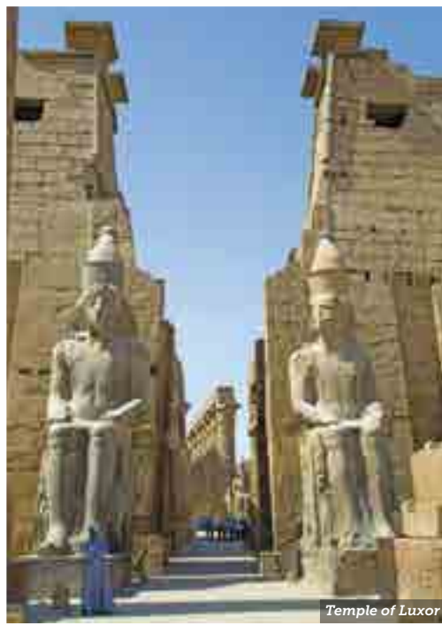
Temple of Luxor