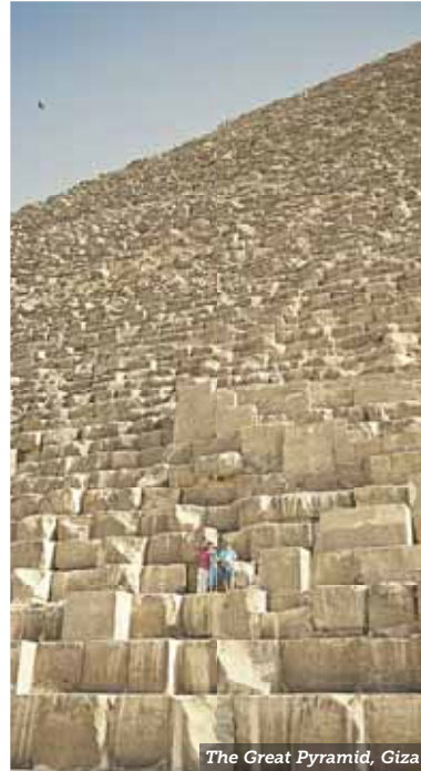
The Great Pyramid, Giza