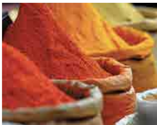
Top: The Sphinx and pyramids of Giza | Left: Cairo | Above: Spices in Khan el Khalili bazaar, Cairo

In the Solar Boat Museum, see a cedar vessel thought to be over 4,500 years old, intended as transportation for a pharaoh in the afterlife.