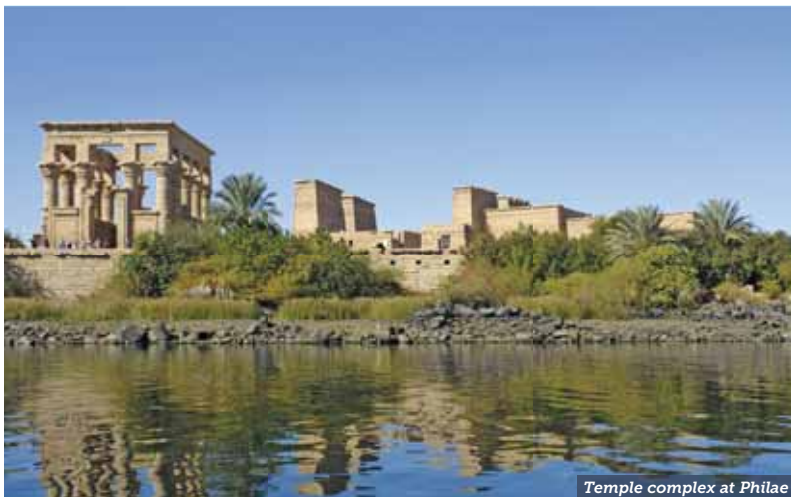
Temple complex at Philae