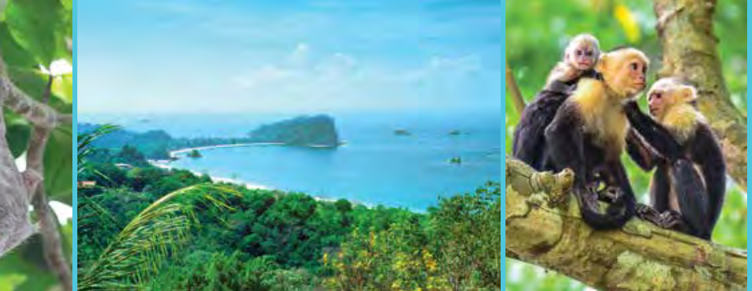
toed pygmy Visit Manuel Antonio National Park, established in 1972, where white sand meets lush rainforest.