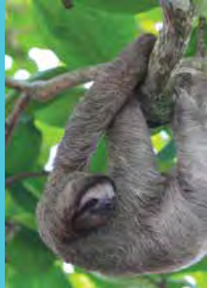
Look for the endangered, three-toed sloth at Manuel Antonio National Park.

Enjoy a guided walk in the morning, the best time of day to watch for groups of capuchin and howler monkeys, coatis, iguanas and more than 230 bird species.