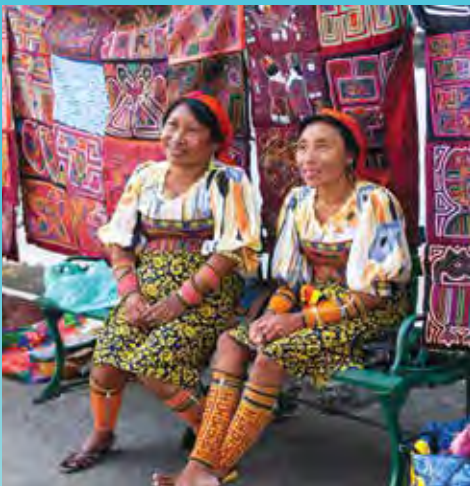
Interact with the Guna people of Panamá's San Blas region.

people, also known as the Kuna, and their centuries-old language, customs and culture. The Guna live in thatched-roof huts, barter or trade in fish and agricultural products and travel in dugout canoes. Guna women hand embroider traditional colorful molas (reverse appliqué panels) and wear winis , long strings of tiny beads wrapped around their forearms and legs in striking geometric patterns.