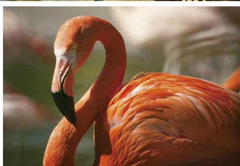
Above: Avignon | Inset: Flamingo, Camargue Nature Park

• Panoramic Lyon. Discover a plethora of Renaissance buildings, churches and famous