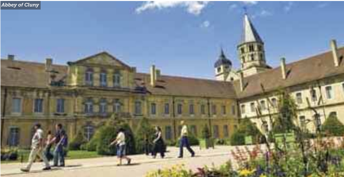
Abbey of Cluny