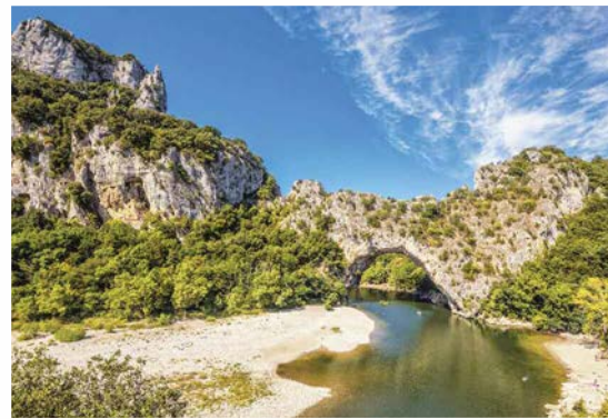
Above: Hôtel-Dieu, Beaune | Inset: Pont d'Arc, Gorges de l'Ardèche

Discovery: Avignon Walking Tour. Encounter this immaculately preserved walled city nestled on the banks of the Rhône River. Avignon boasts an astounding trove of churches, chapels, convents and monuments. The façade of the Chapelle de l'Oratoire, a church built in the 17th century by a community of Oratorians, is especially lovely. Stroll through the Place de l'