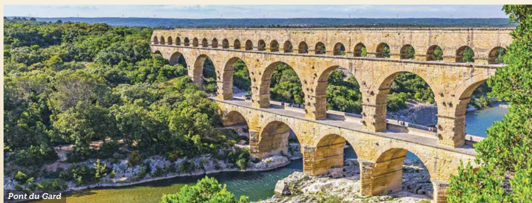
Pont du Gard

Free Time: Lyon has many treasures to share during leisure time, including its splendid gastronomy! If you'd like to try coq au vin , charcuterie or other local specialties, step into a bouchon , a restaurant that serves traditional