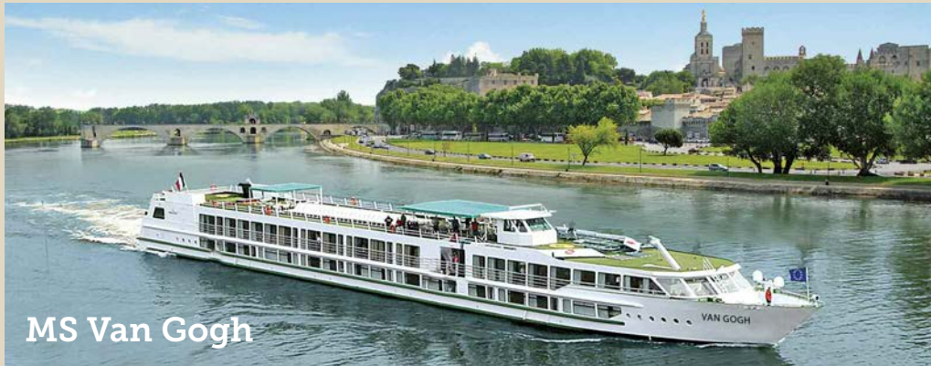
MS Van Gogh

Enjoy European elegance, gracious service and a comfortable cabin while cruising aboard the MS Van Gogh. Share convivial conversation and a cocktail with fellow travelers in the ship's lounge, and relish the beauty and charm of delightful river towns along the Rhône and Saône rivers from its spacious decks. Each morning, enjoy a sumptuous buffet with an assortment of fresh pastries, eggs, meats, fruits and yogurt, and delight in three-course lunches and dinners with menus featuring French cuisine and local ingredients. At the end of each day, return to the comforts of your cabin, appointed in bright, modern décor. Complimentary Wi-Fi is available.