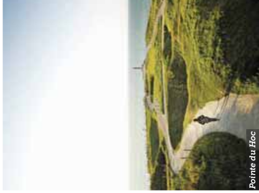
Pointe du Hoc

Normandy's beauty, history and rich culture await you on this wonderful journey!