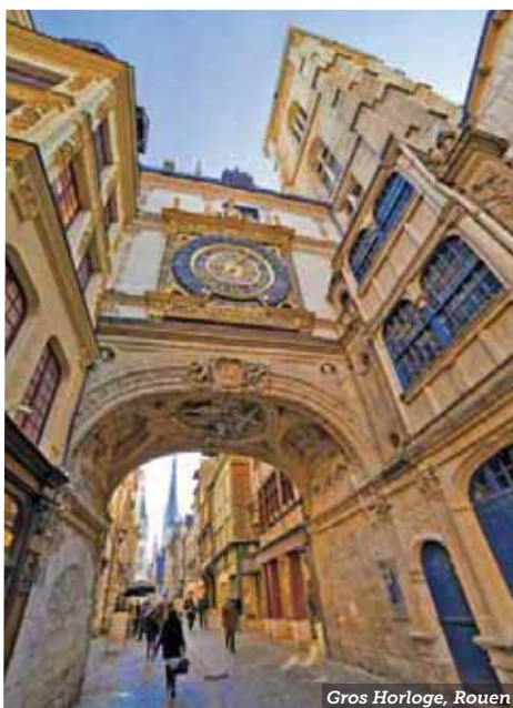
Gros Horloge, Rouen

NOT INCLUDED -Fees for passports and, if applicable, visas; entry/departure fees; personal gratuities; laundry and dry cleaning; excursions, wines, liquors, mineral waters and meals not mentioned in this brochure under included features; travel insurance; airport transfer costs for those not participating in AHI's FlexAir; all items of a strictly personal nature.