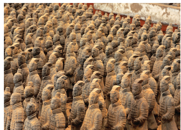
We see the Terra Cotta Warriors of Xian on Day 7.