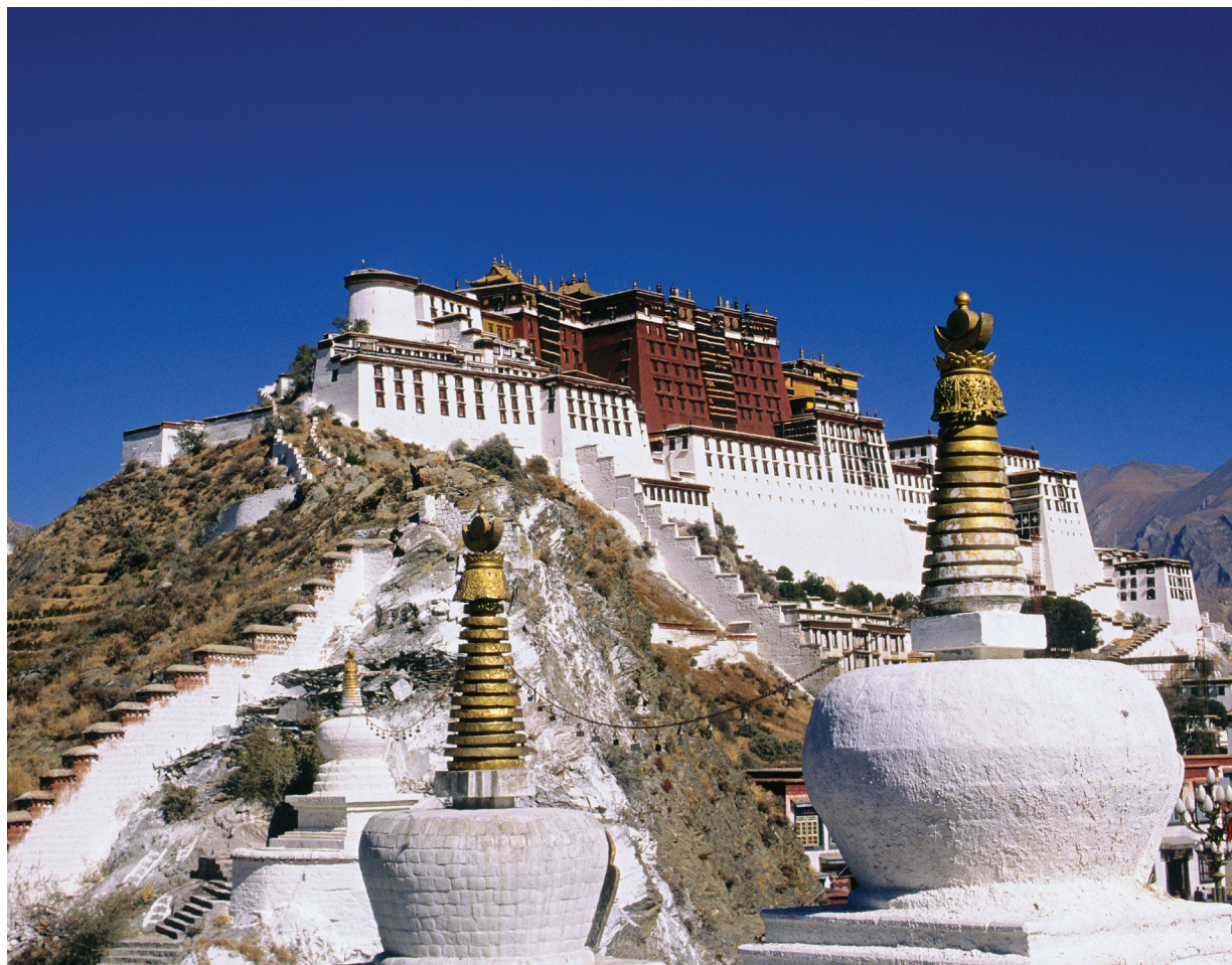
On Day 11 we tour Tibet's Potala Palace, traditional seat of the Dalai Lamas, active Buddhist temple, and UNESCO World Heritage site.