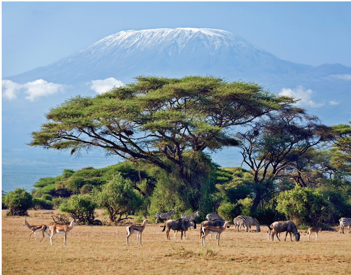
We go on safari in Kenya's Amboseli National Park, in the shadow of Mt. Kilimanjaro.