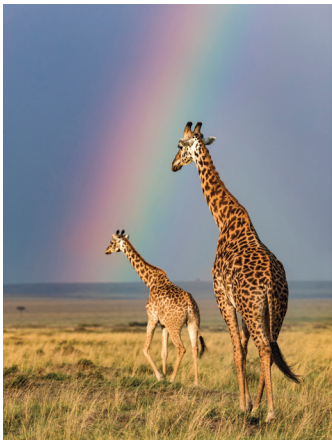
Overlooking the plains ...

Day 11: Serengeti/Masai Mara We leave Tanzania today, crossing into Kenya and continuing on to Masai Mara by air. The Mara is the traditional homeland of the native Maasai people. Known especially for the annual migration that sees some two million wildebeest, plus hundreds of thousands of other plains game migrate here from the Serengeti, the Mara sits in the Great Rift Valley and comprises 583 square miles of vast plains, acacia forests, grass-covered hills, and slow-flowing rivers. We arrive at our tented camp late this morning then have our first game drive here later this afternoon. B,L,D