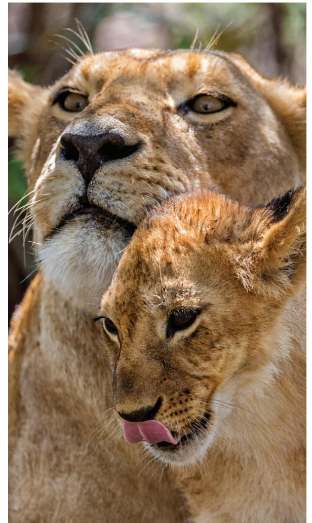
The Serengeti boasts Africa's largest lion population.