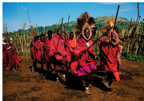
Kenya's native Maasai people

Day 16: Arrive U.S. We reach the U.S. today and connect with our flights home.