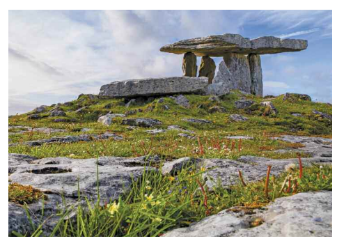
Poulnabrone dolmen, Burren