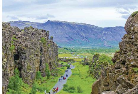
Þingvellir National Park