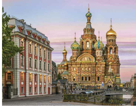
Church of the Savior on Spilled Blood, St. Petersburg