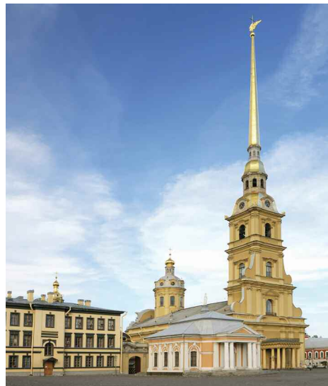
Peter and Paul Fortress