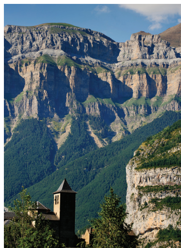
We spend two nights in the Pyrenees.

Day 11: Bilbao/Basque Country A day-long excursion begins with a poignant stop: Gernika (Guernica), heart of the Basque region and the town razed by