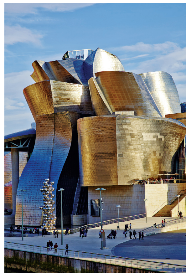
Bilbao's iconic Guggenheim Museum

Day 17: Depart for U.S. We transfer to the airport this morning for our connecting flights to the U.S. B