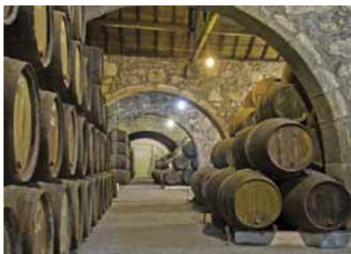
Above: Salamanca | Inset: Port wine cellar

the birthplace of Portugal's first king. Step inside Igreja de Nossa Senhora da Oliveira, and visit the Palace of the Dukes of Bragança, an opulent estate in the city. After, craft your own path of discovery in Guimarães.