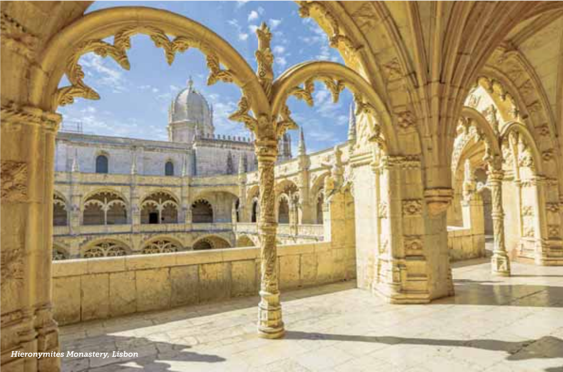
Hieronymites Monastery, Lisbon

Depart your gateway city for Lisbon, Portugal.🌐