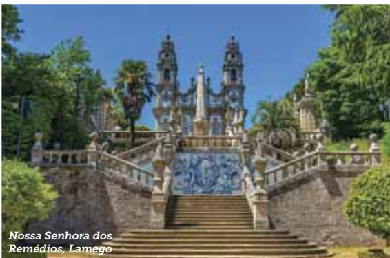
Nossa Senhora dos Remédios, Lamego