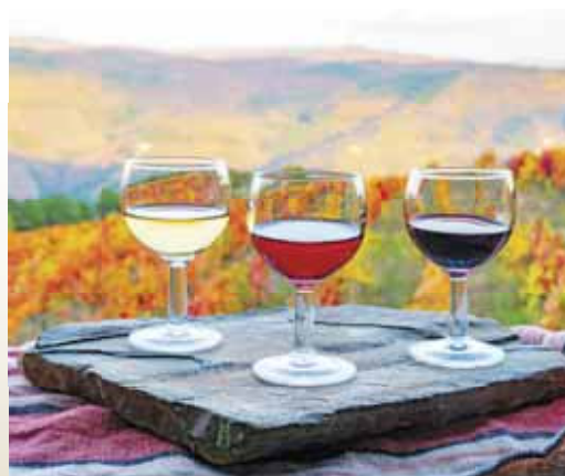
Port wine tasting