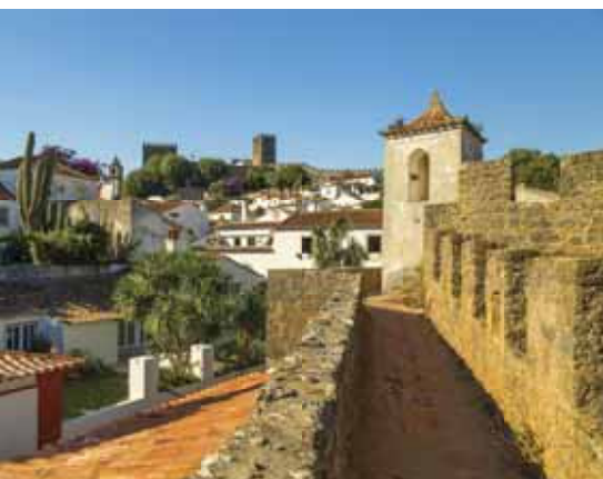
Medieval walls of Óbidos

• Guimarães, Cradle of Portugal. During a walking tour, discover the charms of Guimarães,