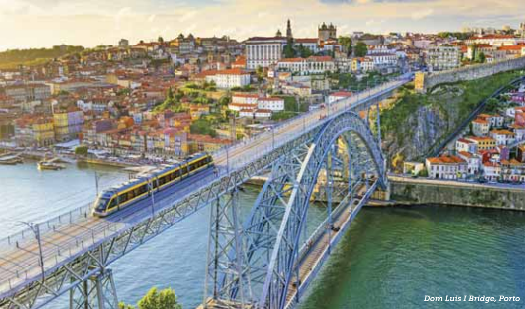
Dom Luis I Bridge, Porto

through the rolling Alto Douro wine region, pausing to revel in a panoramic viewpoint. Visit São João da Pesqueira, known as the “fishing ground” due to its prime fishing location. Join a walking tour before exploring at your leisure. Continue to a traditional country estate and winery, or a quinta , for a tour of the facilities, a presentation about port winemaking and a tasting of the local product. Often characterized as a dessert wine, port is made with indigenous grapes and embodies sweet, rich flavors.