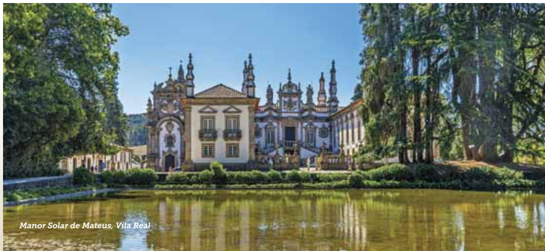
Manor Solar de Mateus, Vila Real