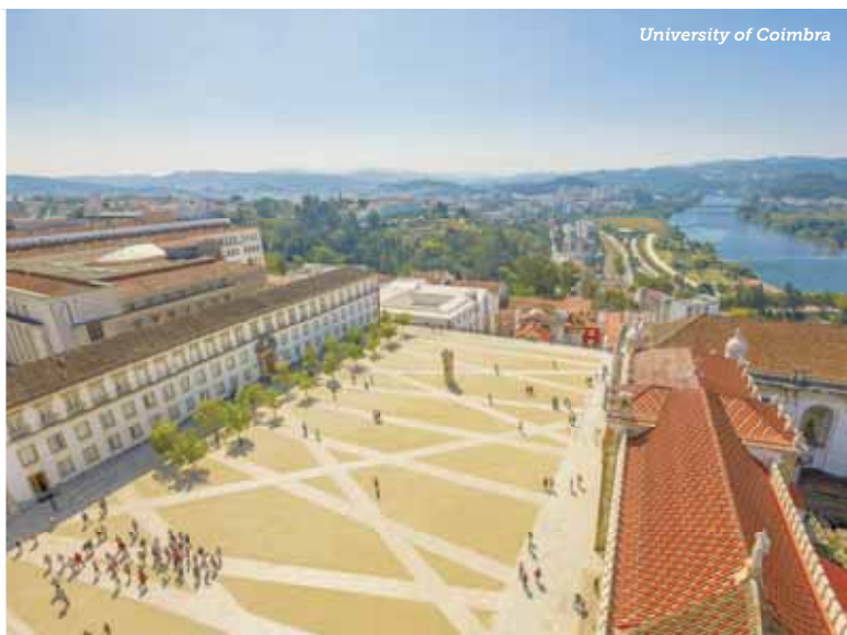
University of Coimbra