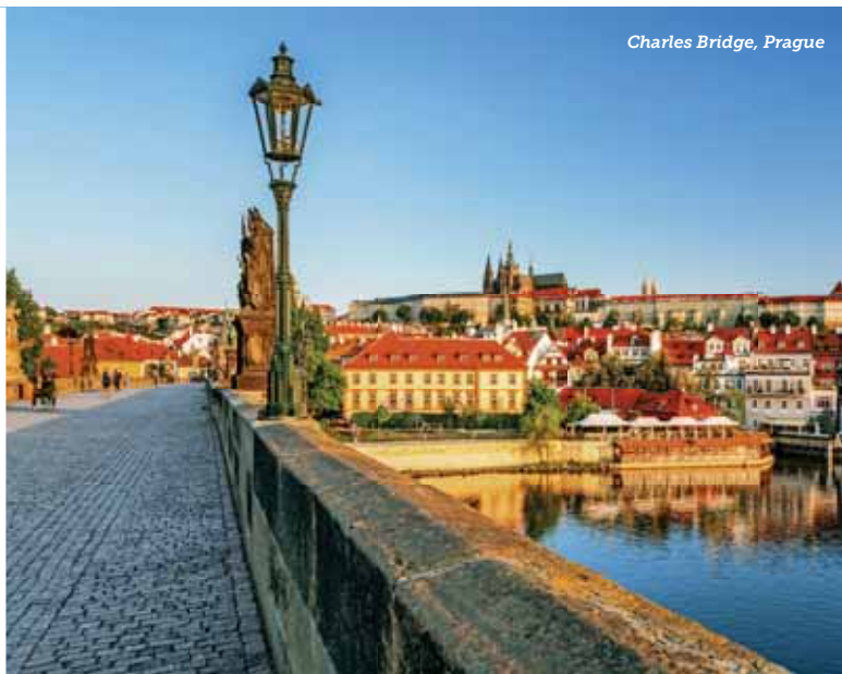
Charles Bridge, Prague