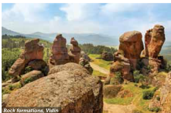
Rock formations, Vidin