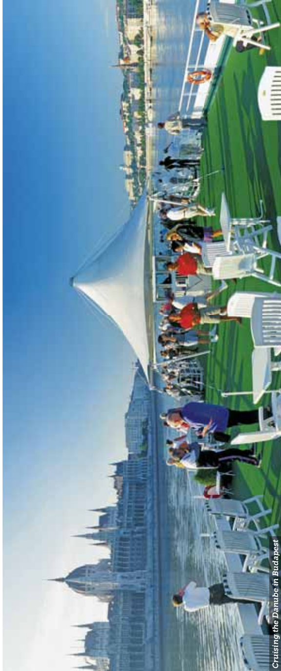
Cruising the Danube in Budapest

Presorted Standard U.S. Postage PAID Mercury Mailing Systems, Inc.