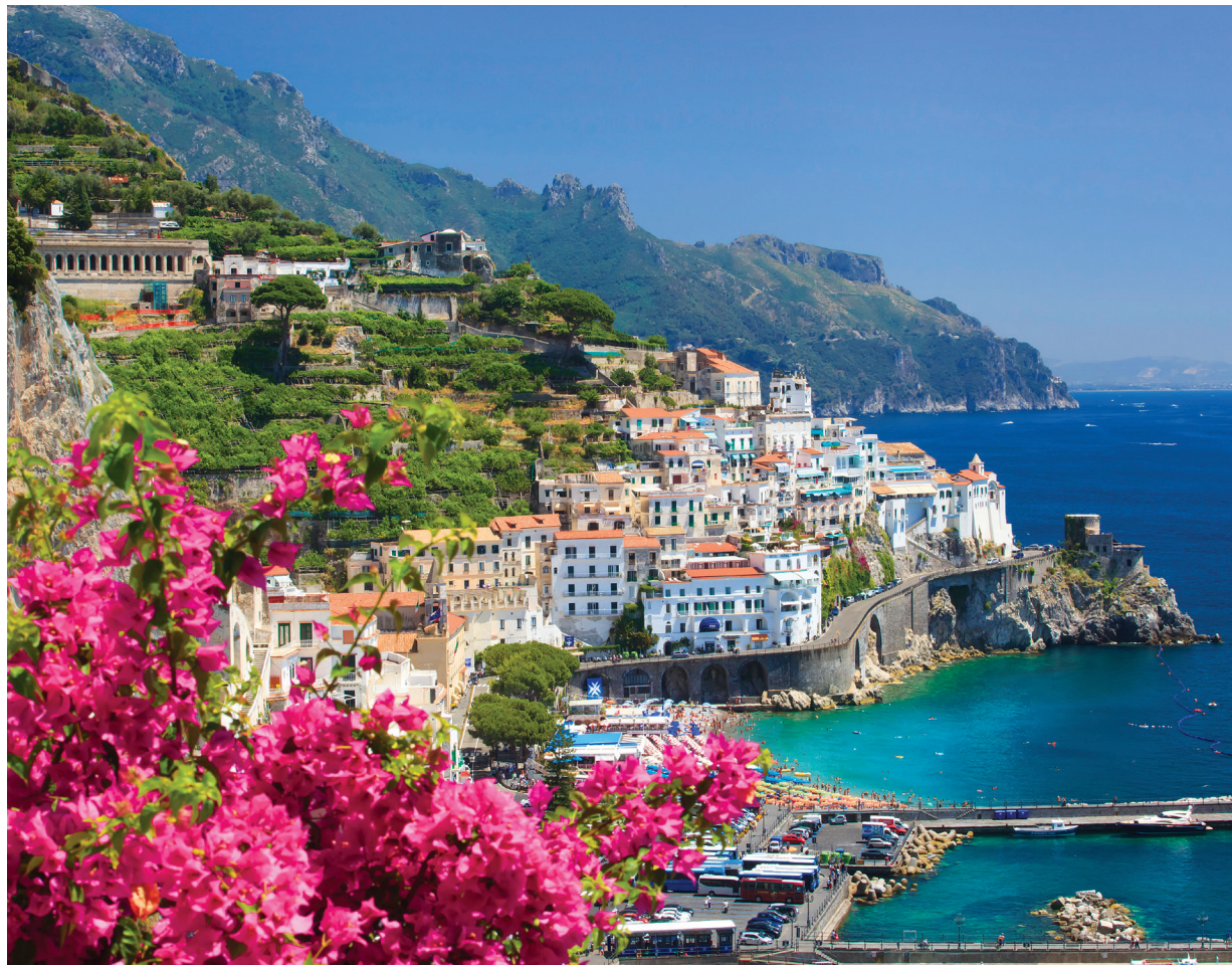
We spend three nights on the stunning Amalfi Coast, with its sheer cliffs, turquoise seas, and classic Mediterranean landscape.