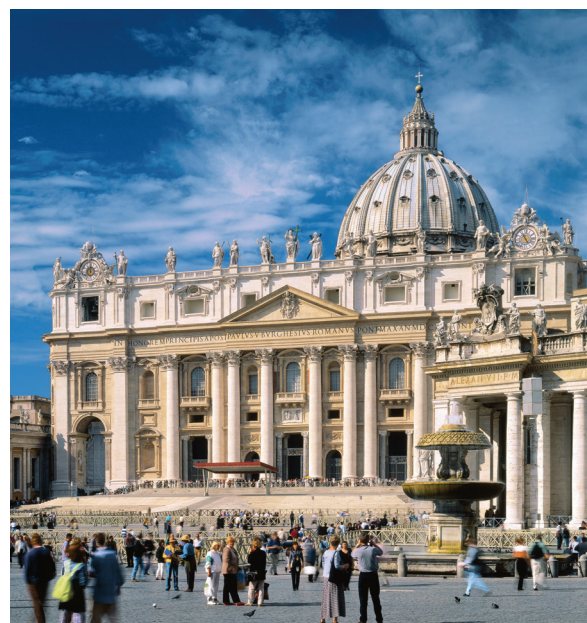
We visit St. Peter's Square and Basilica on Day 7.

Day 14: Tuscany/Venice Leaving Tuscany today, we travel through the Veneto region to Venice, which, along with its lagoon, is a UNESCO site. We arrive early this afternoon; the remainder of the day is free to explore this wondrous city on our own. B