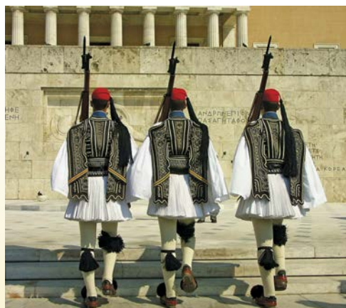
Changing of the guard, Parliament, Athens

Free Time: Set your own fun agenda today! Perhaps linger on one of the many beaches or visit the shops and friendly tavernas.