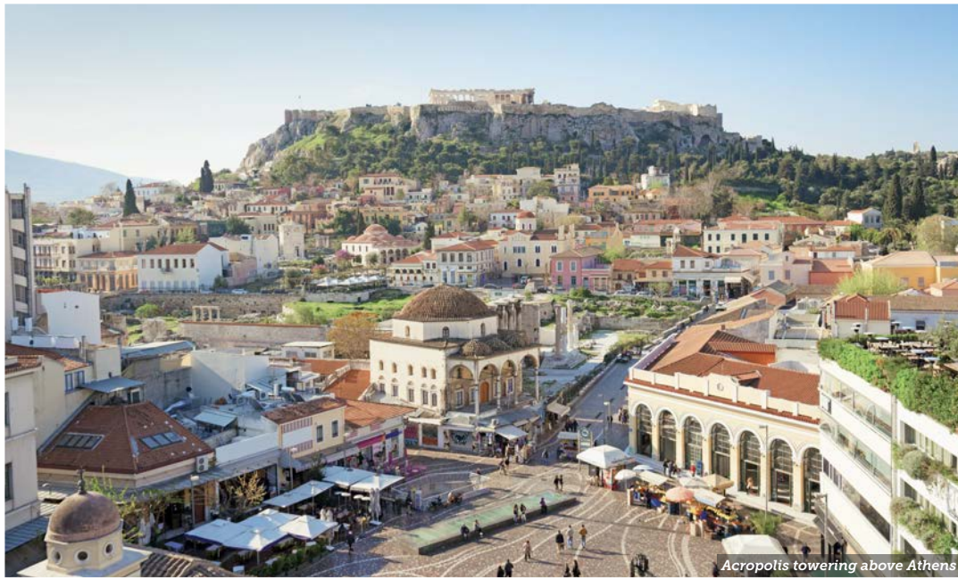
Acropolis towering above Athens