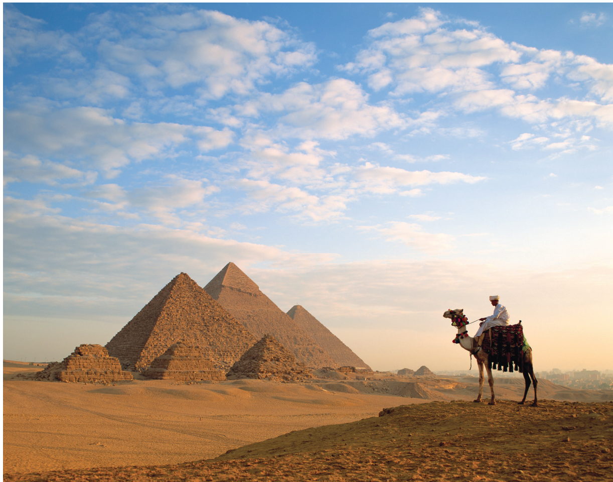
On Day 3 we travel to the Giza plateau to see the legendary pyramids, built 5,000 years ago as royal tombs.