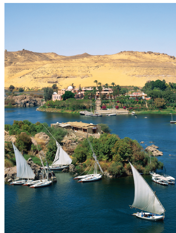
We sail traditional feluccas along the Nile.

Day 15: Depart for U.S. Very early this morning we transfer to the airport for our return flight to the U.S. B