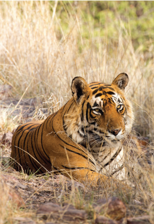
Bengal tiger, Ranthambore

Day 11: Kalakho/Agra En route to Agra, we stop in the ancient village of Abhaneri to see the fortified Chand Baori step well (c. 800 CE), whose 3,500 steps descend some 13 stories into the ground. Continuing on, we reach the ancient Mughal stronghold of Agra, where this afternoon we visit Itimad-ud-Daulah, the two-story marble “Baby Taj” that inspired the Taj Mahal. B,D