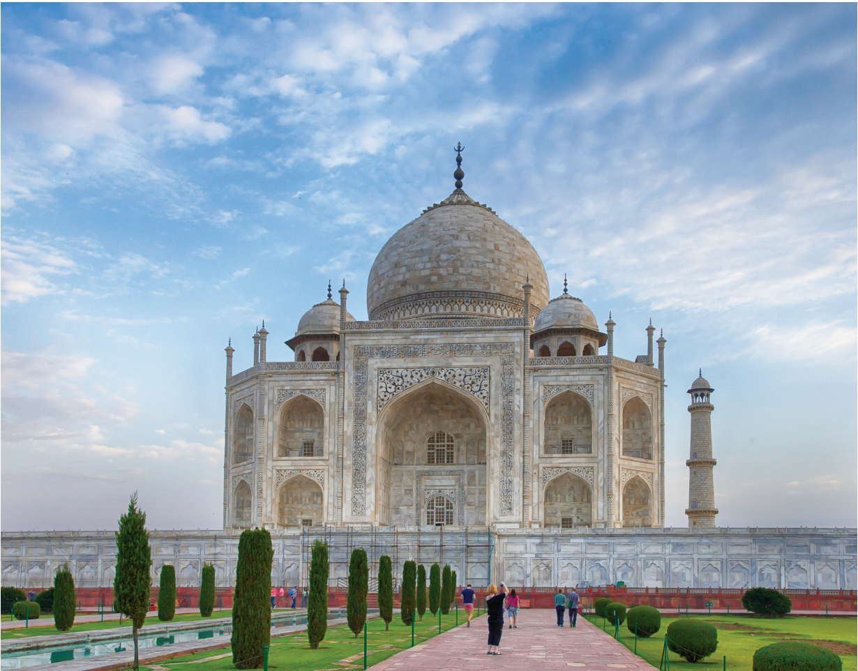
On Day 12 we visit the Taj Mahal, a UNESCO site considered one of the world’s most beautiful buildings.

Ratings are based on the Hotel & Travel Index, the travel industry standard reference. Unrated hotels may be too small, too new, or too remote to be listed.