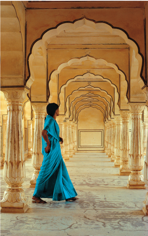
On Day 6, we visit Jaipur’s Amber Fort, a UNESCO site.