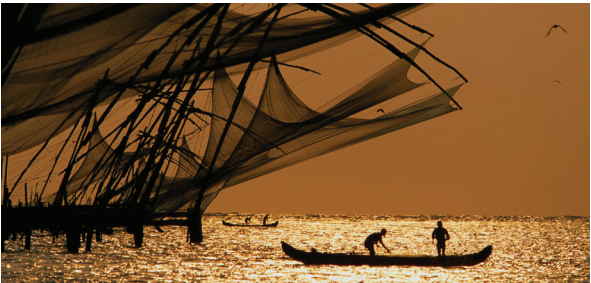
Chinese fishing nets along the shores of Kochi

Day 17: Return to U.S. Very early this morning we transfer to the airport for our return flight to the U.S.