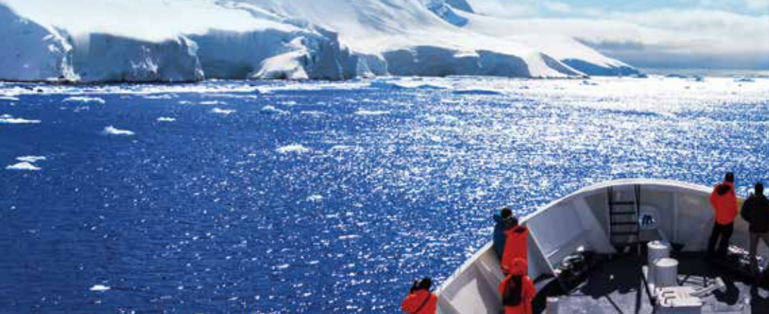
Photo this page: Enjoy the calm waters and surreal beauty of captivating glacier-lined Lemaire Channel, first traversed in 1898 by Belgian explorer Adrien de Gerlache.

Cover photo: Expert-led Zodiac excursions offer up-close viewing of craggy crescent peaks, intricate ice floes and distinctive wildlife that thrives in the extreme conditions of this remote Antarctic landscape.