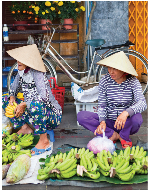
Selling produce at Hoi An market

Day 14: Saigon This morning we visit the Cu Chi Tunnels, the infamous underground network from which North Vietnamese forces operated in wartime. Tonight we celebrate our journey over a farewell dinner. B,D