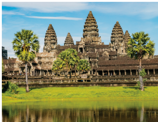
Angkor Wat (post-tour extension)

Day 14: Saigon This morning we visit the Cu Chi Tunnels, the infamous underground network from which North Vietnamese forces operated in wartime. Tonight we celebrate our journey over a farewell dinner. B,D