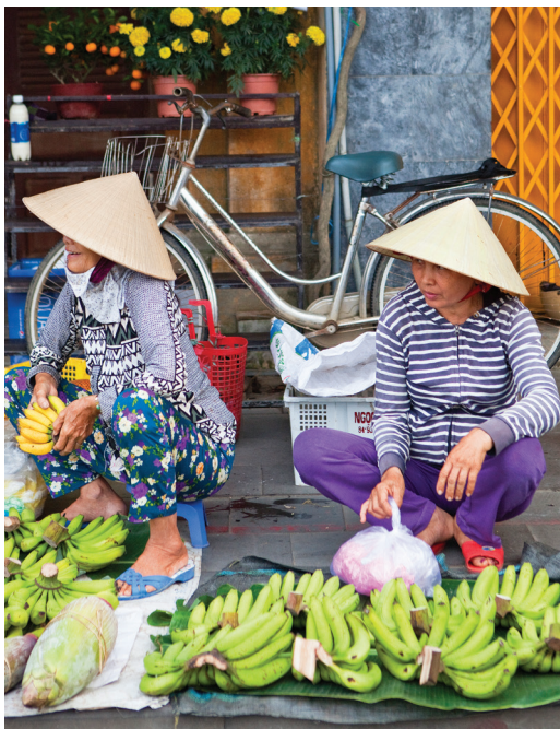
Selling produce at Hoi An market

Day 15: Depart for U.S. Today we transfer to the airport for our return flights to the U.S. B