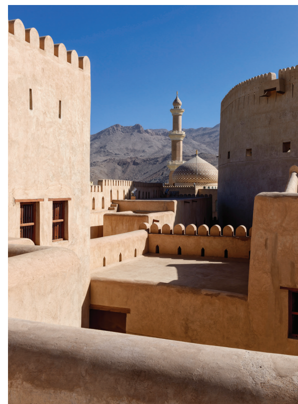
Oman’s Nizwa Fort, which dates to the 1650s.

Day 12: Depart for U.S. Early this morning we depart for the airport and our return flight to the U.S., where we connect with our flights home.