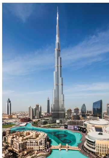
Dubai’s Burj Khalifa

Day 8: Muscat/Wahiba Sands Leaving Muscat this morning, we travel by four-wheel-drive vehicles to our desert camp. En route we visit Wadi Arabayeen, with its deep pools of turquoise water set amidst the date palms. Traveling on, we stop next for photos at the stunning White Beach in the village of Fins, then in Sur, once Oman’s most important East African port and where locals still craft dhows in the traditional manner. After lunch together at a beach hotel we continue on to Mintrib and take our first off-road