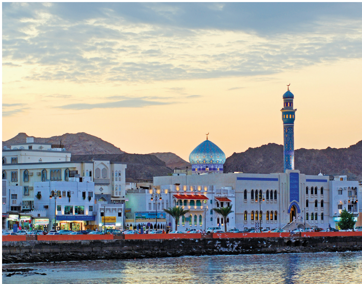
On Day 6 we visit Muscat's Muttrah district, home to the famed Muttrah souk and with a beautiful setting on the seaside corniche.