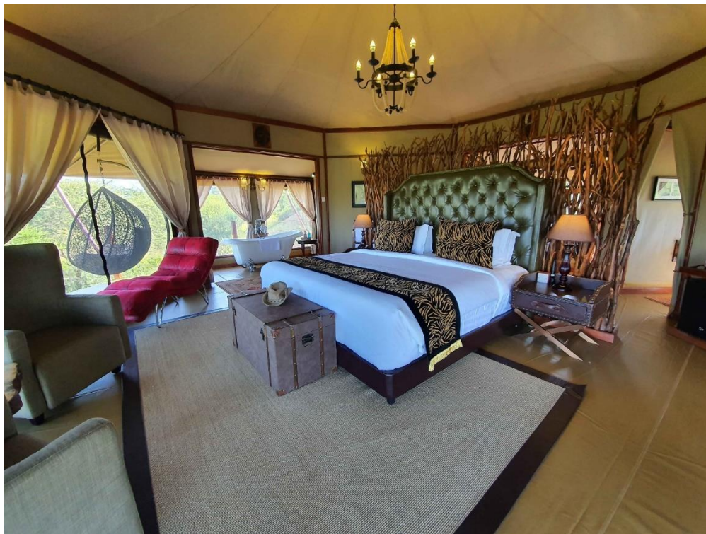
Tarangire Kuro Treetops Lodge

Connect in Amsterdam and arrive in the U.S.