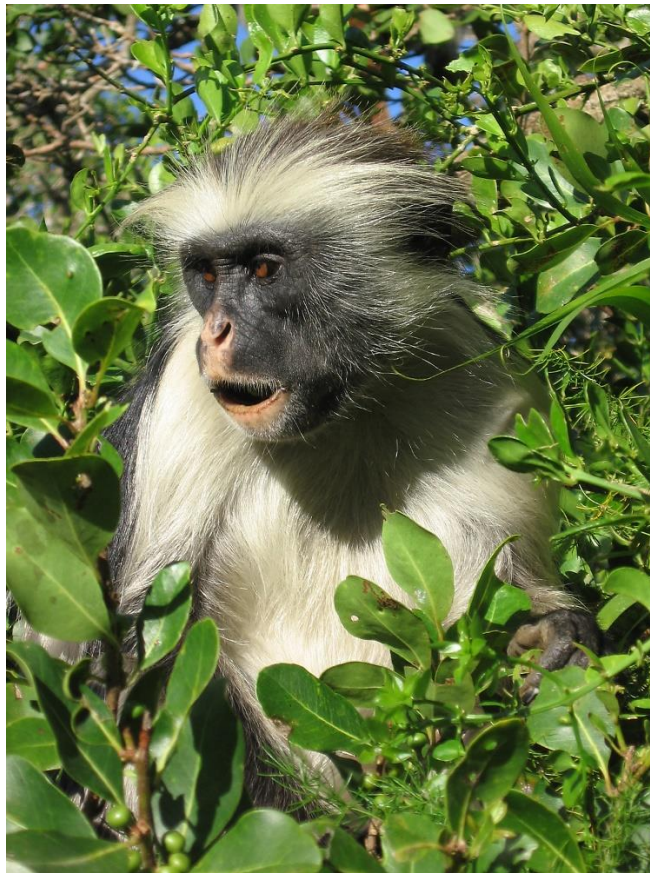
Red Colobus Monkey / Safari Legacy