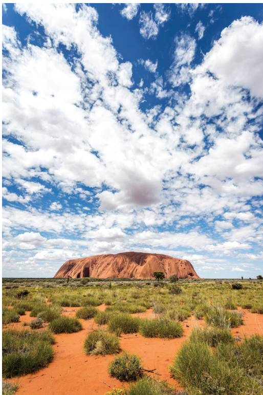
We visit the Aboriginal site of Uluru (Ayers Rock) on Day 8.