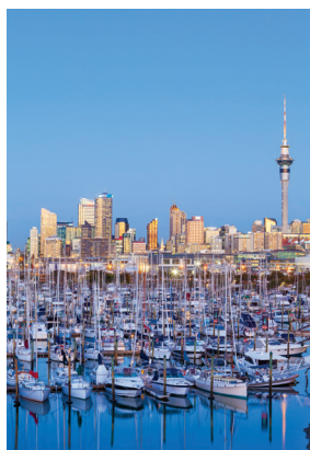
Auckland, City of Sails

Day 18: Queenstown/Rotorua We depart today for the Maori center of Rotorua, with its geysers, bubbling mud pools, and hot thermal springs. Upon arrival, we take a panoramic tour of this city on the shores of Lake Rotorua. This evening we visit Te Puia Thermal Reserve and Cultural Centre for a traditional hangi dinner and Maori performance. B,D