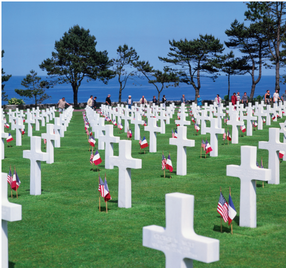
On Day 12, we visit the American Cemetery at Omaha Beach.

Day 10: Saumur/Mont-St-Michel/Crépon Traveling north this morning, we stop at Mont-St-Michel,