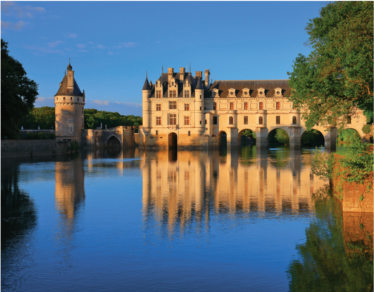
Château de Chenonceau, which we tour on Day 9, boasts an exceptional collection of 16 th - to 18 th -century European art and furniture.

Ratings are based on the Hotel & Travel Index, the travel industry standard reference. Unrated hotels may be too small, too new, or too remote to be listed.