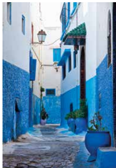
Rabat's Kasbah des Oudaias

Day 8: Erfoud/Rissani/Merzouga This morning we visit the city of Rissani, with its 18 th -century ksar , a virtually impenetrable warren of alleys. We enjoy a tour highlight this afternoon as we set out on a sunset excursion to the breathtakingly beautiful sand dunes at Merzouga on the edge of the Sahara. In the enormous silence we watch the sun set over the desert as we take a camel ride along the erg . Following this experience, we'll have dinner together in this desert setting before returning to our hotel tonight. B,L,D