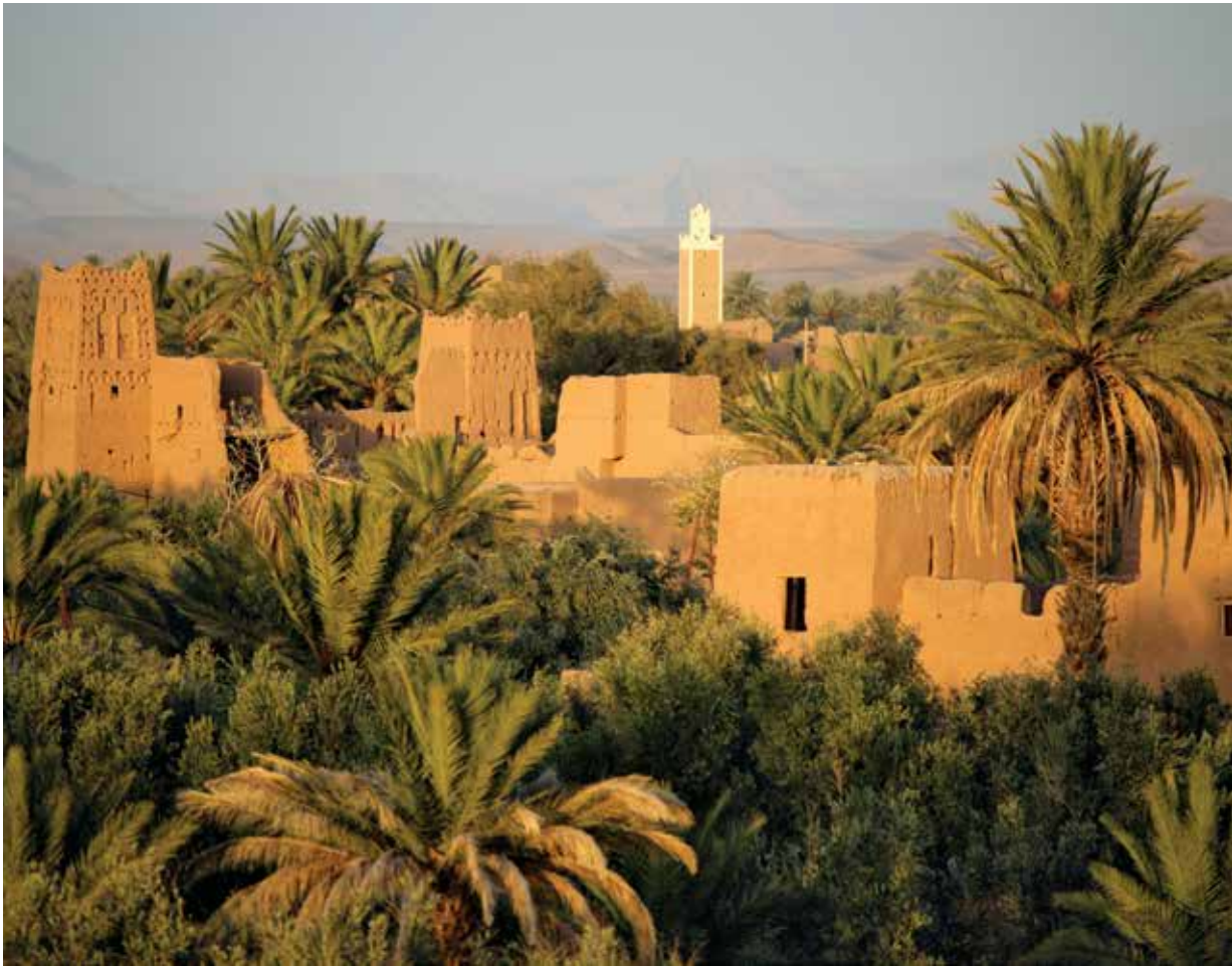
We encounter many of Morocco’s age-old kasbahs on our journey.

Ratings are based on the Hotel & Travel Index, the travel industry standard reference.