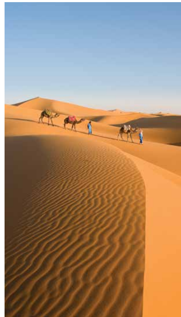
We ride camels in the Sahara on Day 8.

Prices include international airfare and all taxes, surcharges, and fees