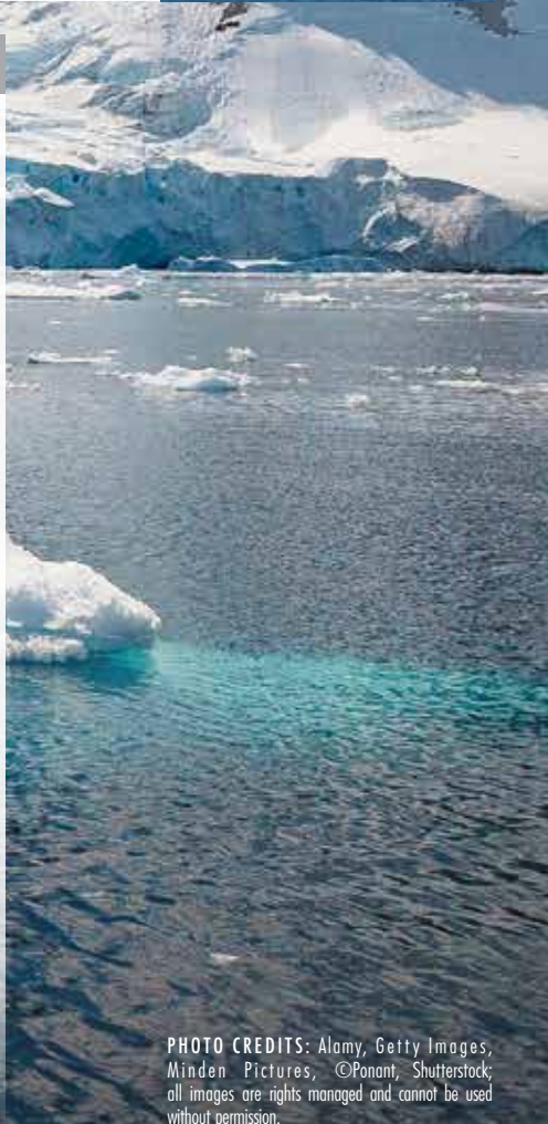
PHOTO CREDITS: Alamy, Getty Images, Minden Pictures, ©Ponant, Shutterstock, all images are rights managed and cannot be used without permission.