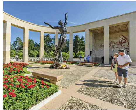
Normandy American Cemetery