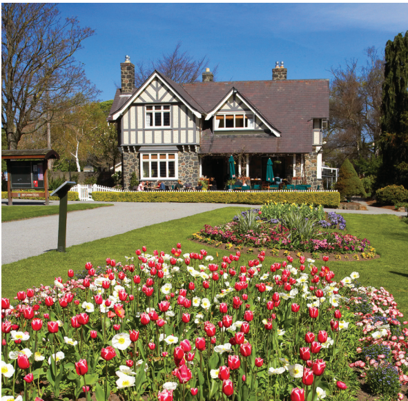
We tour Christchurch’s Botanic Gardens on Day 10.

New Zealand adventure over a farewell dinner at a local restaurant. B,D