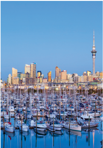
Auckland, City of Sails

Day 9: Wellington We encounter this genial waterfront city on the southern end of the North Island on this morning’s tour featuring a ride on the historic Wellington Cable Car for panoramic views of the city and harbor. We also visit acclaimed Tē Papa, New Zealand’s national museum with interactive exhibits spanning art, history, native cultures, and the natural environment. Then the remainder of the afternoon is free to explore as we wish, perhaps to stroll along bohemian Cuba Street; visit the Wellington Zoo; or wander the lively waterfront area. We dine together tonight at a local restaurant. B,D