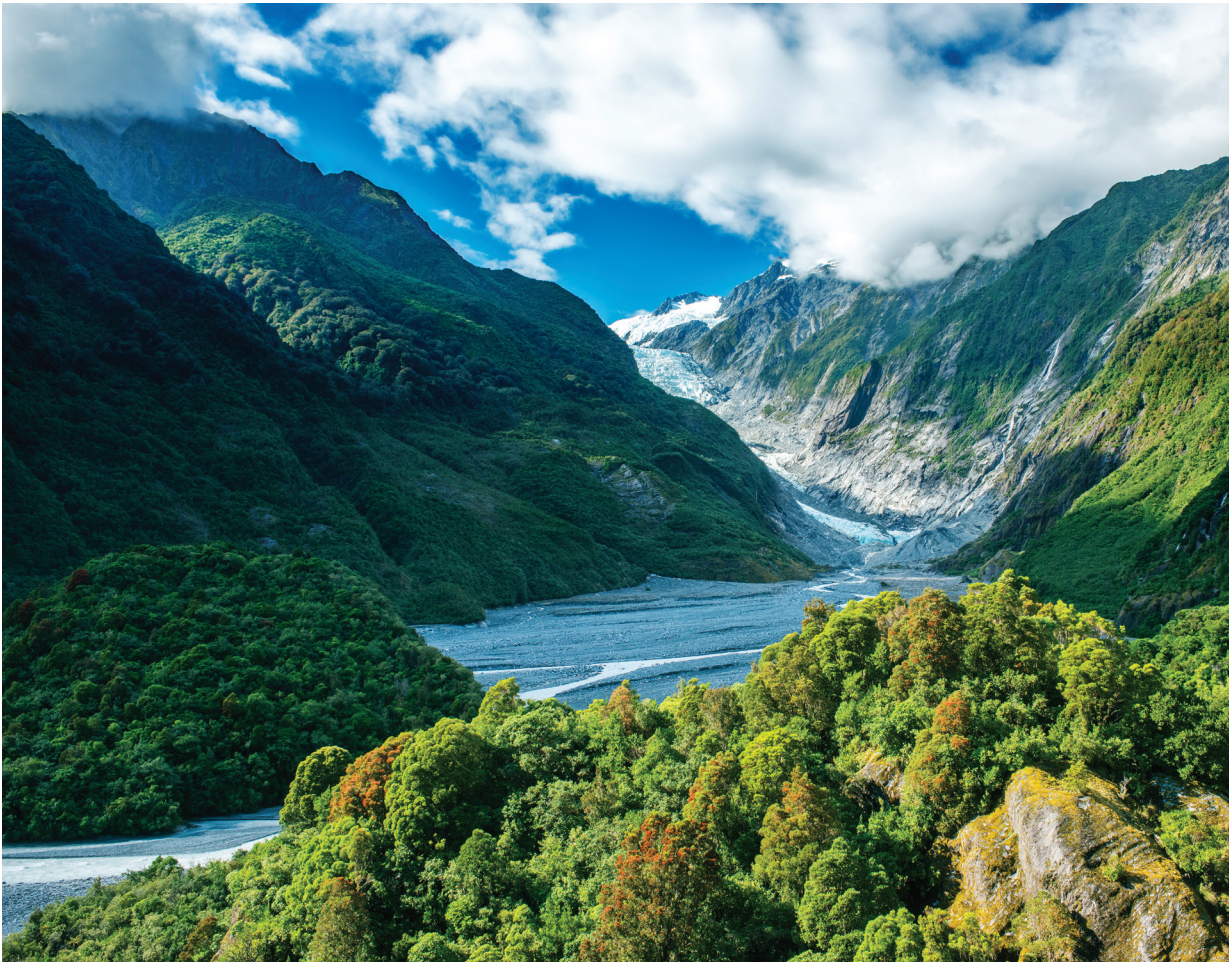
We see 7 1/2-mile-long Franz Josef Glacier up close on a guided walk through the glacier valley on Day 12.

Ratings are based on the Hotel & Travel Index, the travel industry standard reference.