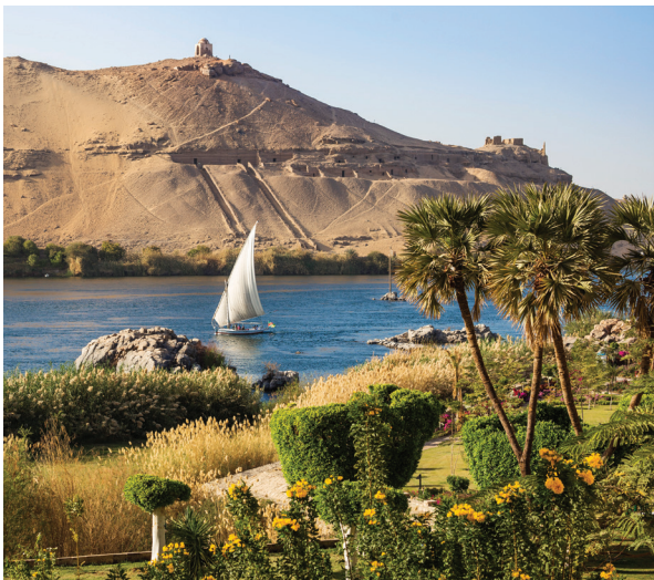
We sail traditional feluccas along the Nile.

Day 14: Cairo This morning we encounter Old Cairo, the district where early capital cities once stood. We visit 5 th -century St. Sergius Church, the Coptic church of el-Muallaqa, and Ben Ezra Synagogue, built in 882. Mid-day we return to our hotel where tonight we enjoy a farewell dinner. B,D