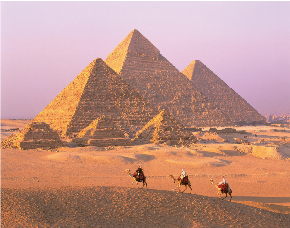
On Day 4 we travel to the Giza plateau to see the legendary pyramids, built 5,000 years ago as royal tombs.

Ratings are based on the Hotel & Travel Index, the travel industry standard reference.