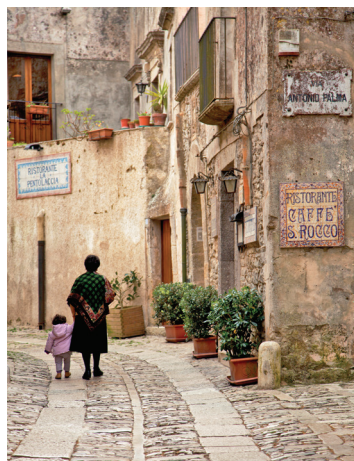
Palermo street scene

We travel across Sicily’s southern reaches today to Syracuse (Siracusa), stopping along the way in Piazza