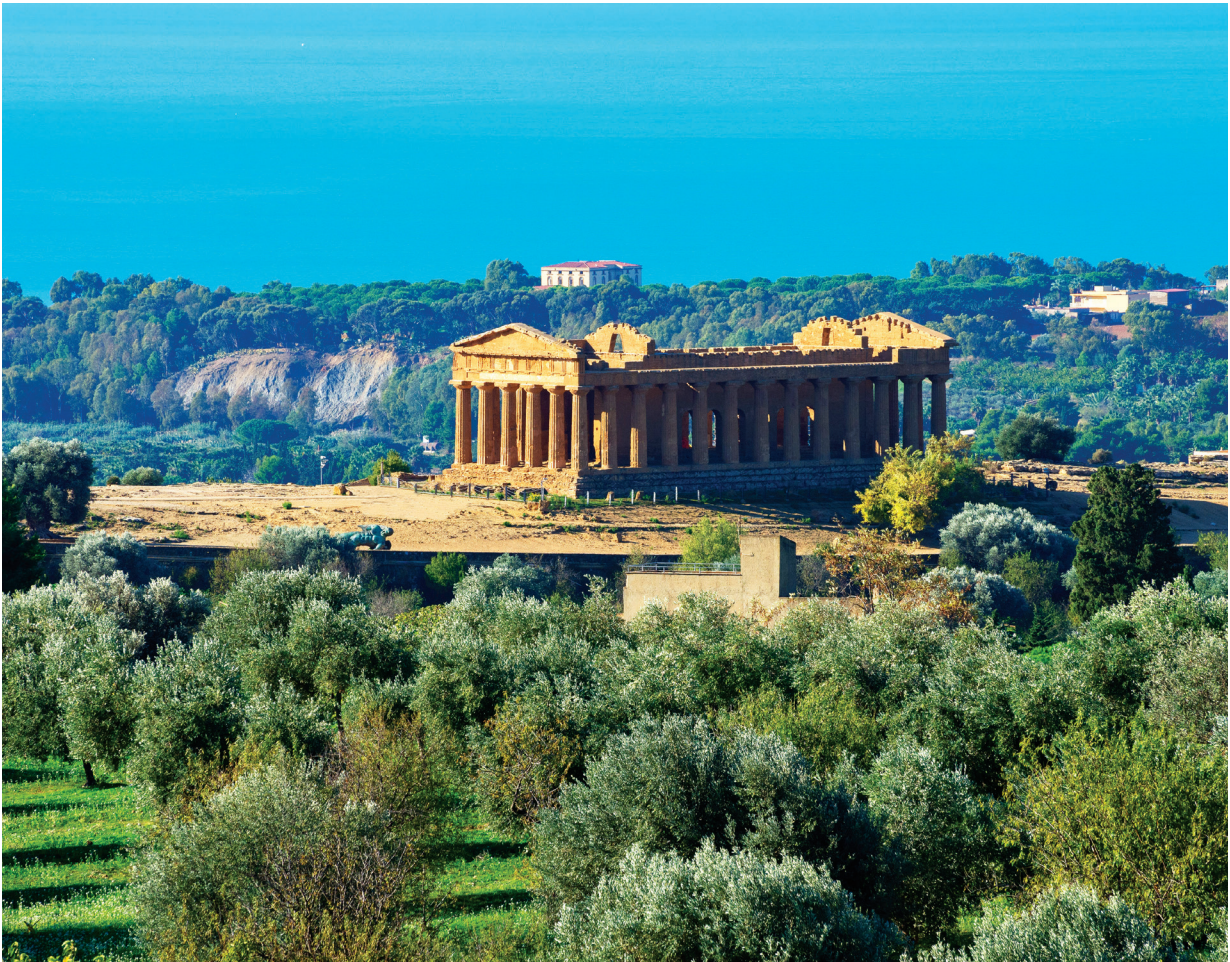
On Day 6, we explore the Valley of the Temples in the hilltop city of Agrigento. Above: Temple of Concordia