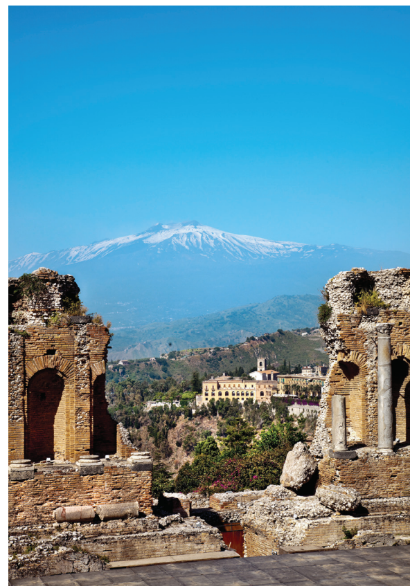
Taormina’s ancient theater overlooks Mt. Etna.

Day 12: Depart for U.S. We transfer today to the Catania airport for our return flight to the U.S. B