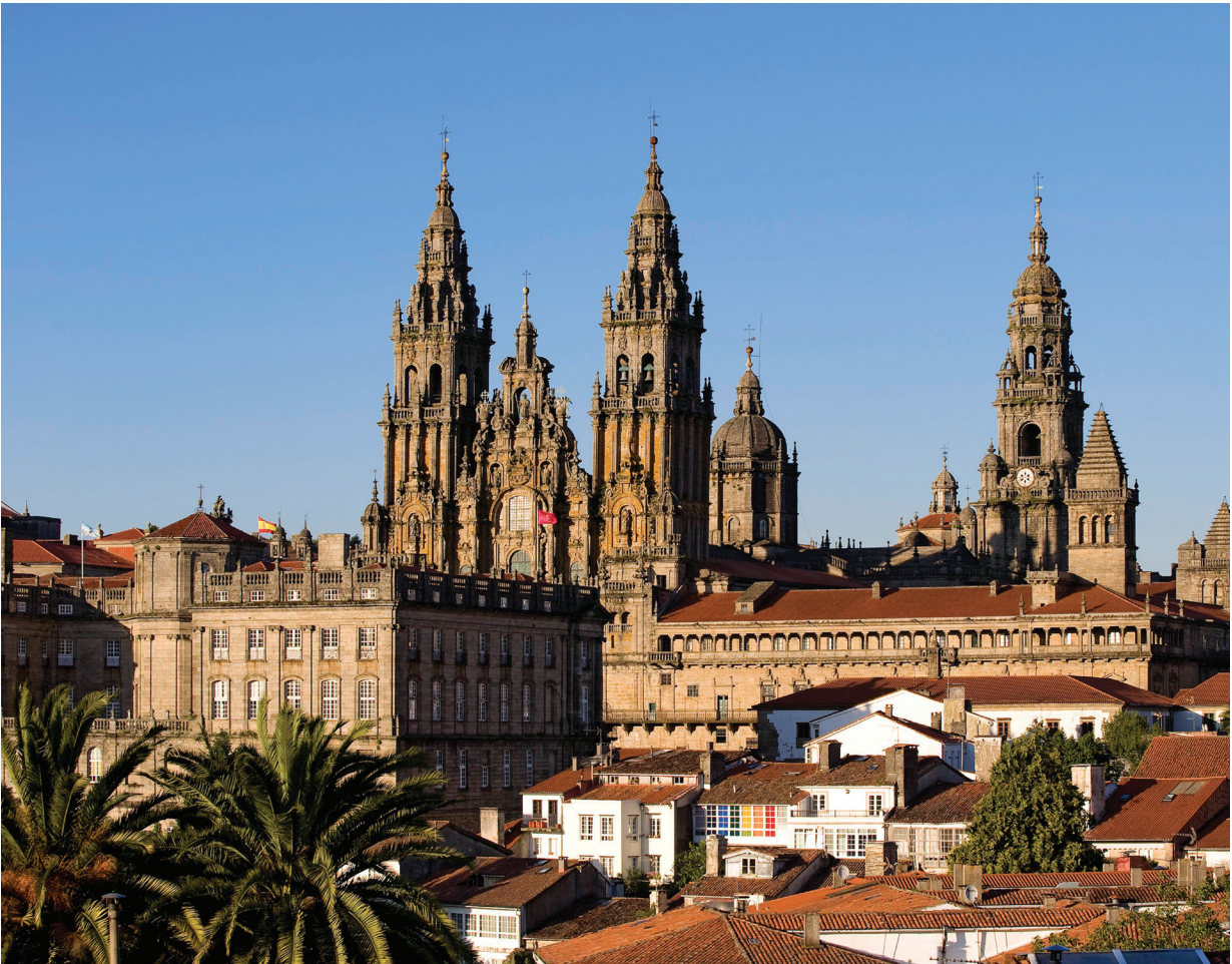
Santiago's 11 th -century cathedral, which we visit on Day 7, is the last stop on the pilgrimage route of the Way of St. James.

Day 2: Arrive Lisbon We arrive in the Portuguese capital and transfer to our hotel. As guests' arrival times vary, we have no group activities planned during the day. Tonight we enjoy a welcome dinner. D