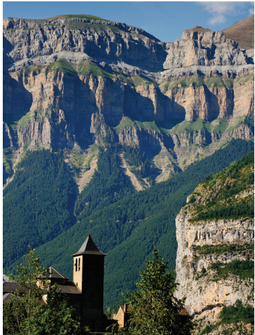
We spend two nights in the Pyrenees.

Day 11: Bilbao/Basque Country A day-long excursion begins with a poignant stop: Gernika (Guernica), heart of the Basque region and the town razed by