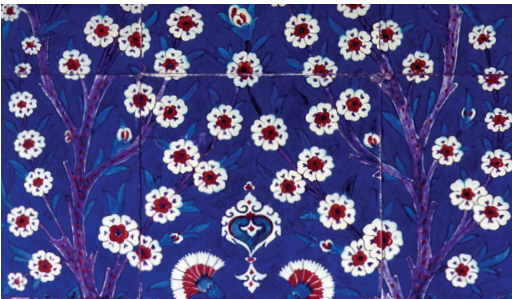
Exquisite Iznik tiles

Day 13: Antalya We discover Antalya’s charming old city (Kaleici) on a morning walking tour through its narrow streets, past historic buildings, mosques, and parks. After lunch at a local restaurant, we visit Antalya’s acclaimed Archaeological Museum, housing priceless artifacts unearthed from sites throughout the region. B,L