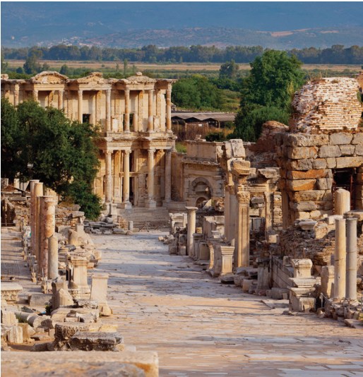
Ruins at Ephesus

Day 14: Antalya/Perge This morning we explore the ruins at Perge, an ancient Greek city once among the world’s prettiest and most prosperous. We also visit the Duden Waterfalls, which tumble about 130 feet into the Mediterranean. Returning to our hotel, this afternoon is at leisure. Tonight, we celebrate our Turkish adventure over a farewell dinner at a harbor-side restaurant. B,D