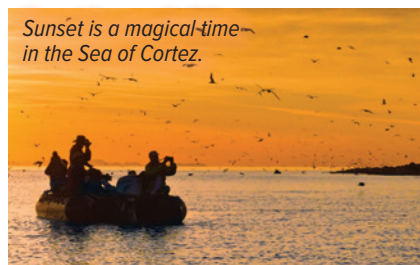
Sunset is a magical time in the Sea of Cortez.

On the other side of the Baja peninsula, in the Sea of Cortez, you discover the uninhabited desert islands that dot the clear blue sea. Search for a variety of whale species, scores of leaping dolphins, and diving seabirds. Hike a forest of giant cacti, kayak or paddleboard in protected coves, snorkel with sea lions (conditions permitting), and join a naturalist aboard a Zodiac to observe the diverse birdlife along the shores. When you see Baja’s islands with their desert landscape, rugged cliffs, and white sand beaches reflected in an azure sea, you’ll understand immediately why they have been designated a UNESCO World Heritage site.