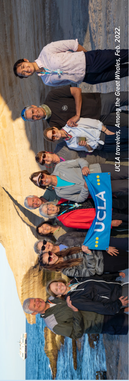
UCLA travelers, Among the Great Whales, Feb. 2022.