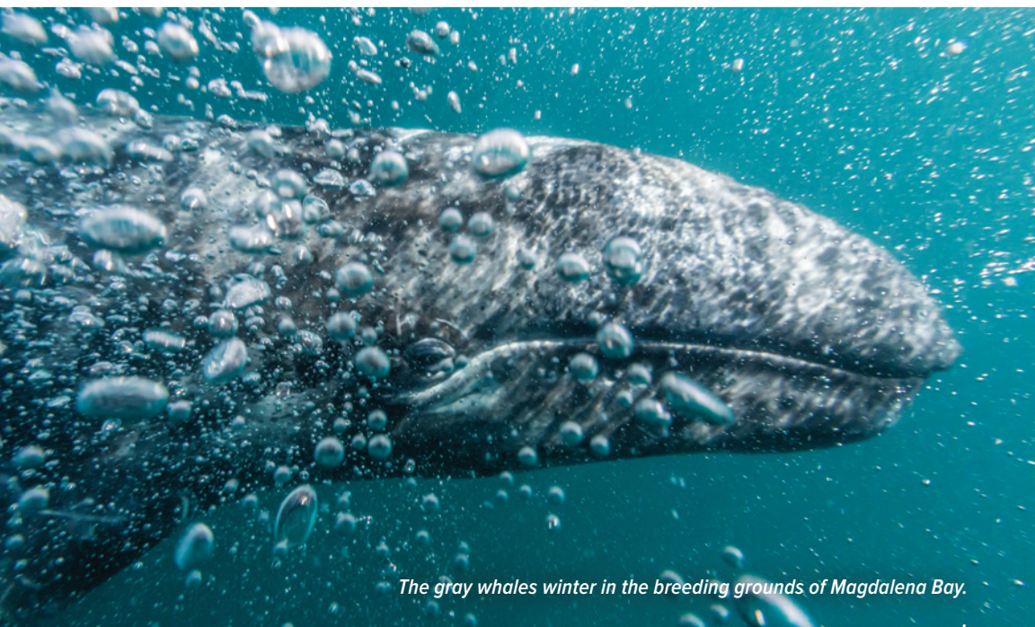
The gray whales winter in the breeding grounds of Magdalena Bay.

8 DAYS/7 NIGHTS—ABOARD NATIONAL GEOGRAPHIC VENTURE