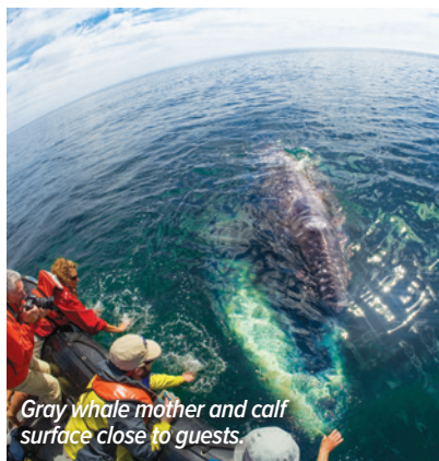
Gray whale mother and calf surface close to guests.

You can whale watch in a number of places in the world, but only in Baja can you have a personal encounter—and you will have plenty of chances to get up close to these gentle giants. Gray whales migrate annually from their feeding grounds in Alaska to the nursery lagoons on the Baja California peninsula to give birth and nurture their young. Spend time among the mothers and their calves, observing them at water level aboard local pangas guided by