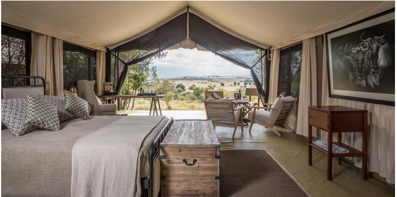
Entim Mara Camp