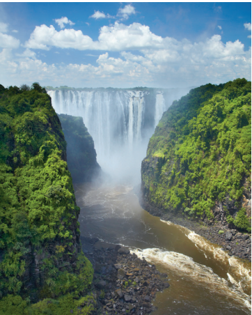
Victoria Falls, the "smoke that thunders"

Day 10: Chobe National Park/South Luangwa National Park, Zambia This morning we board a plane for the flight to South Luangwa National Park. Here in one of Africa’s last stretches of pristine wilderness we have the chance to get closer to the animals than anywhere else. Late afternoon we engage in some of the lodge’s