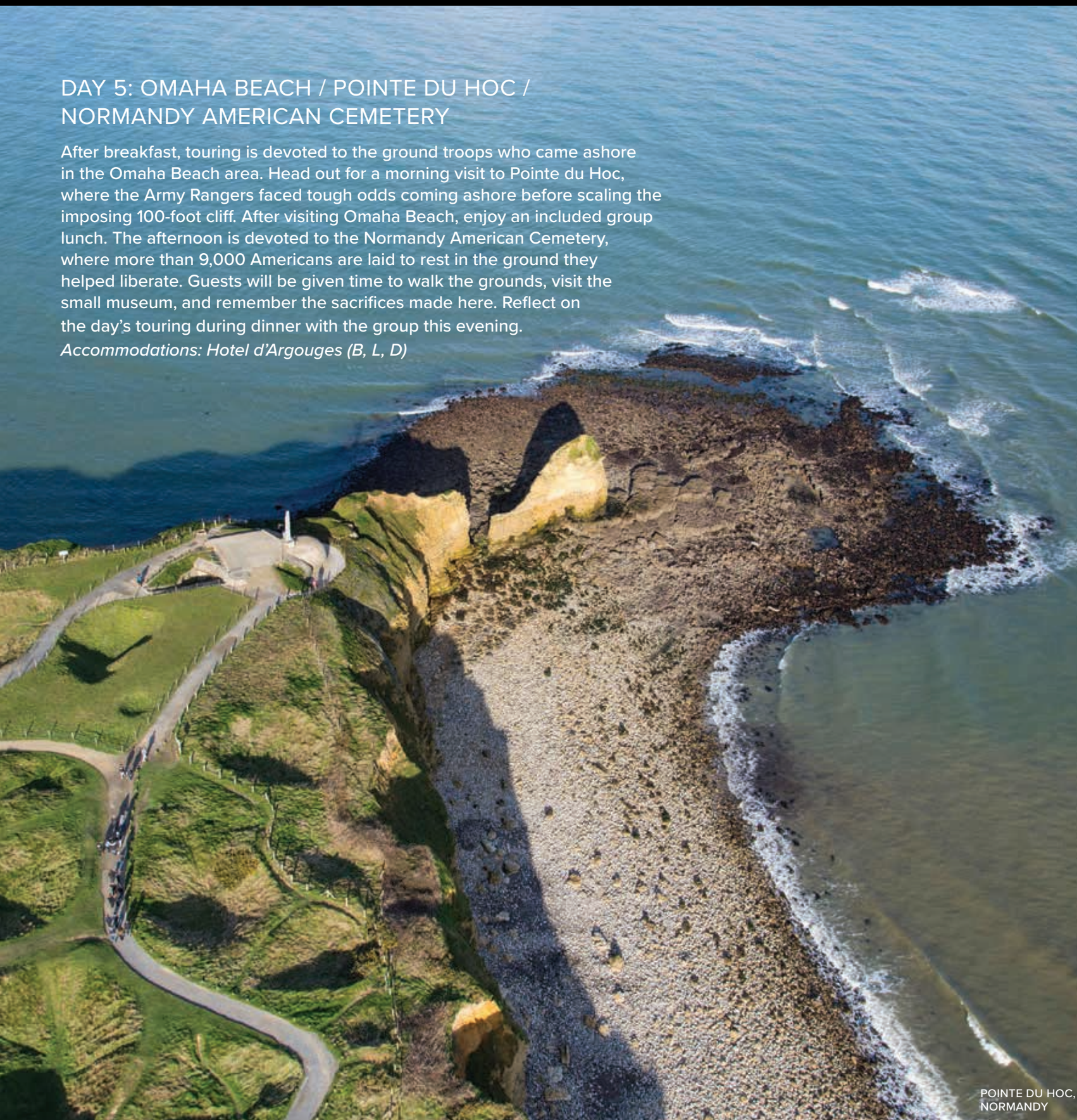
POINTE DU HOC, NORMANDY

Accommodations: Hotel d'Argouges (B, L, D)