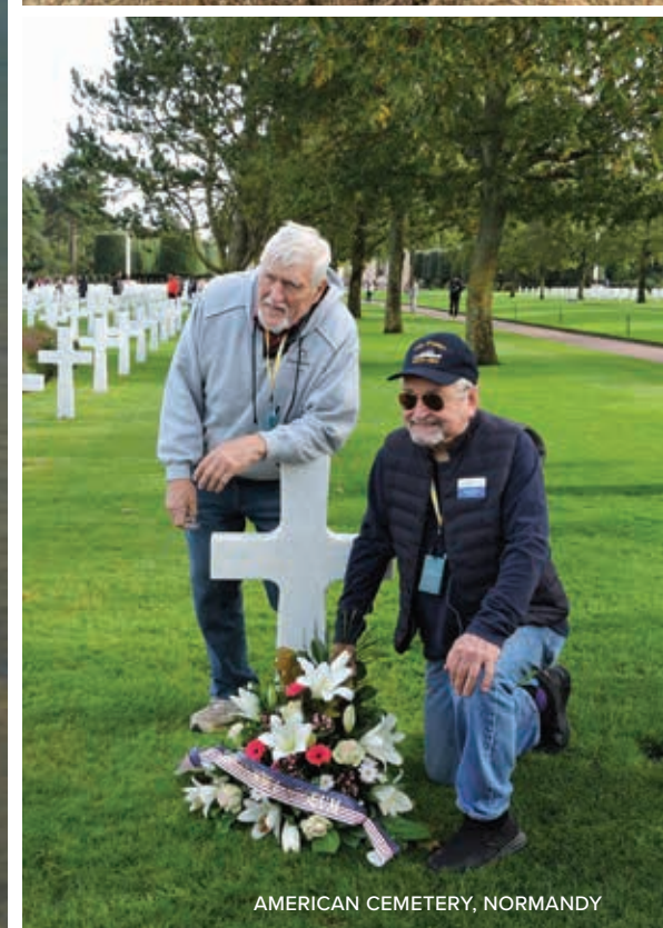
AMERICAN CEMETERY, NORMANDY