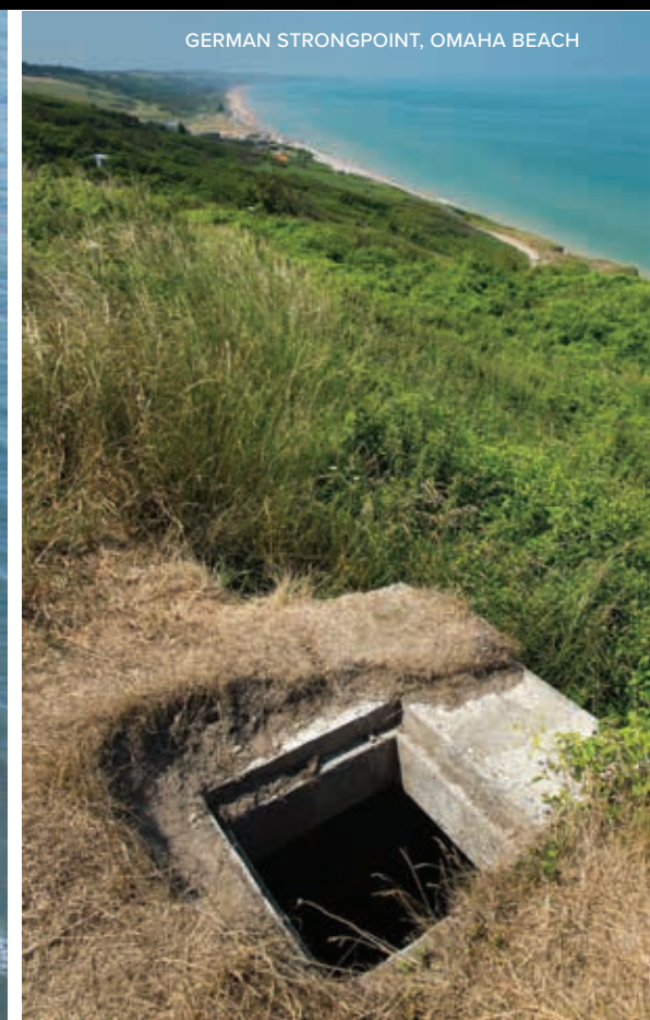
GERMAN STRONGPOINT, OMAHA BEACH