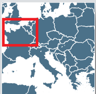
Flights not included.