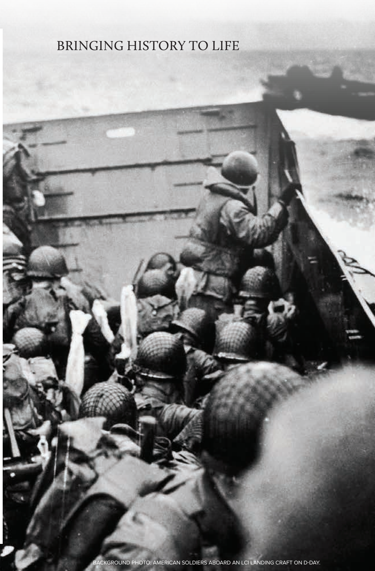
BACKGROUND PHOTO: AMERICAN SOLDIERS ABOARD AN LCI LANDING CRAFT ON D-DAY.