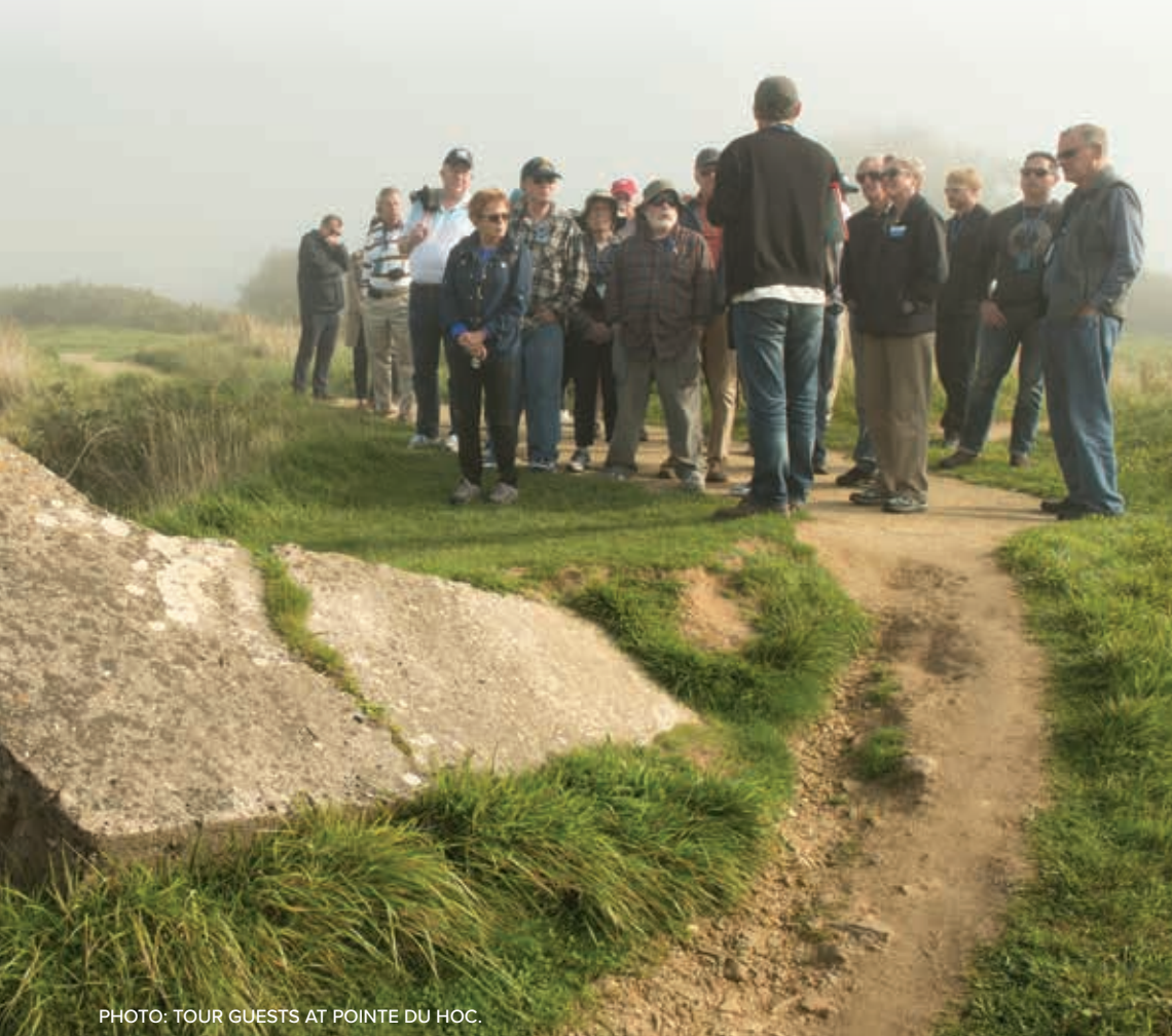
PHOTO: TOUR GUESTS AT POINTE DU HOC.

For more than two and a half years the Allies planned and gathered their military strength to launch the decisive amphibious invasion of northern France and strike a mortal blow against the Third Reich. In anticipation, Adolf Hitler stockpiled reserve units in the Atlantic Wall defenses across the French coastlines, determined to drive the Allied forces back into the sea when the invasion was finally launched. There would be no second chance for the Allies: The fate of the continent hangs upon this decisive day.