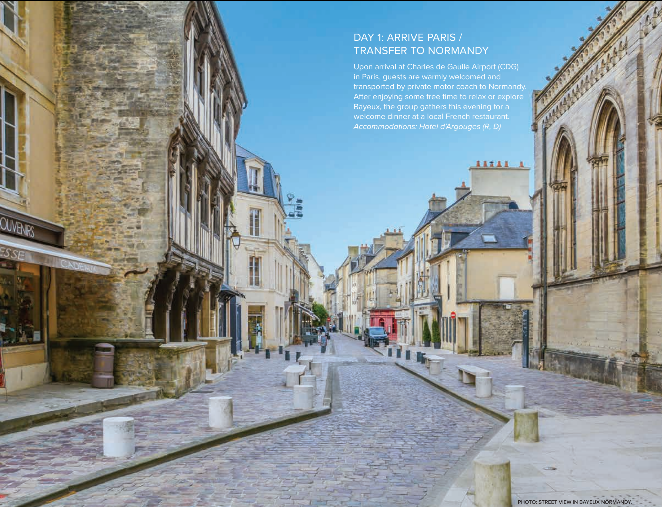
PHOTO: STREET VIEW IN BAYEUX NORMANDY.

Upon arrival at Charles de Gaulle Airport (CDG) in Paris, guests are warmly welcomed and transported by private motor coach to Normandy. After enjoying some free time to relax or explore Bayeux, the group gathers this evening for a welcome dinner at a local French restaurant. Accommodations: Hotel d'Argouges (R, D)