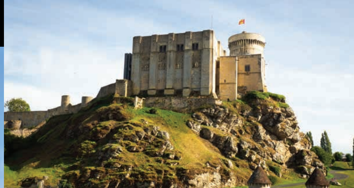
CHÂTEAU DE FALAISE

Journey into the Middle Ages on our custom-curated extension program focused on the historic importance of the picturesque Normandy region.