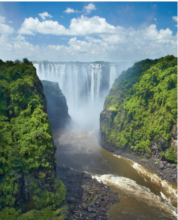
Victoria Falls, the "smoke that thunders"

Day 10: Chobe National Park/South Luangwa National Park, Zambia This morning we board a plane for the flight to South Luangwa National Park. Here in one of Africa’s last stretches of pristine wilderness we have the chance to get closer to the animals than anywhere else. Late afternoon we engage in some of the lodge’s