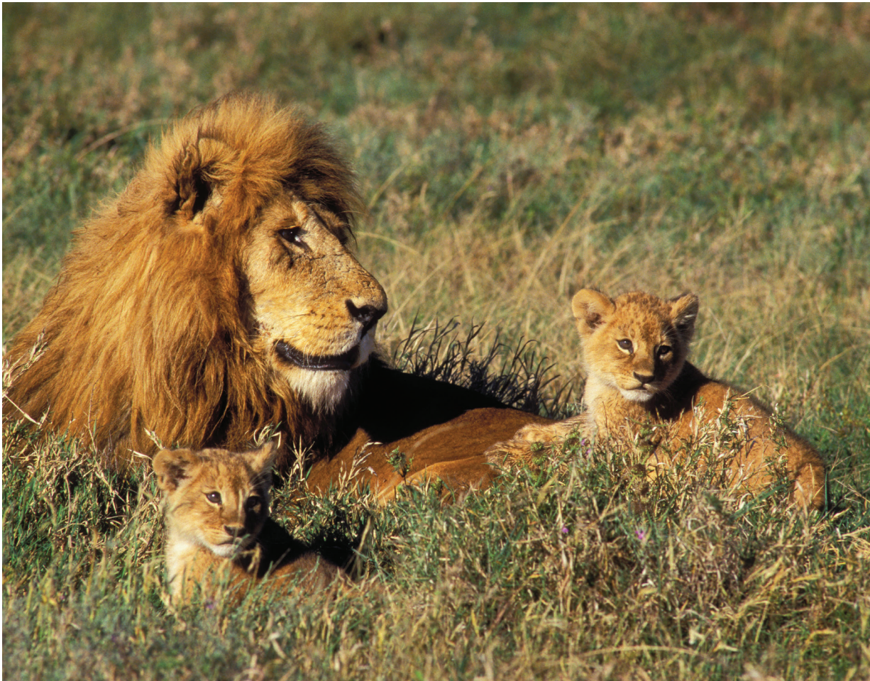
We may see lions, among other big game, while on safari.

Day 2: Arrive Johannesburg Upon arrival we transfer to our hotel in the suburb of Rosebank, where our rooms will be ready for our early check-in. As guests' arrival times may vary greatly, we have no group activities planned. B