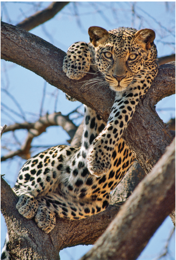
Getting comfortable ...

Day 13: South Luangwa National Park/Lusaka/ Depart for U.S. We travel by light aircraft today to Lusaka, Zambia’s capital, where we have hotel day rooms until our departure this evening for the airport and our overnight flight to the U.S. B