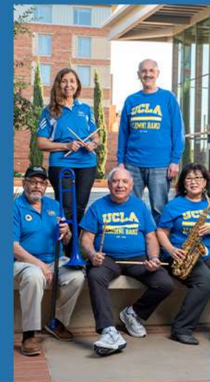
The UCLA Alumni Band Network of the Year