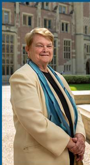
Sheila Kuehl '62 Edward A. Dickson Alum of the Year