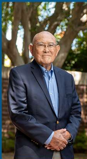
The Honorable A. Wallace Tashima '58 Professional Achievement