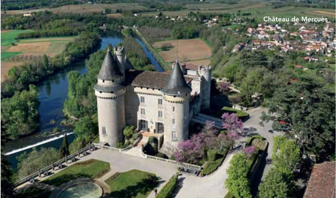
Château de Mercuès