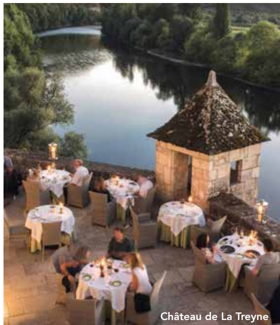
Château de La Treyne