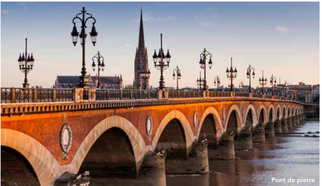
Pont de pierre