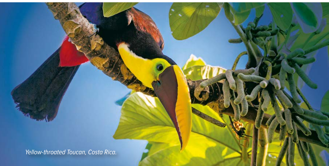
Yellow-throated Toucan, Costa Rica.

8 DAYS/7 NIGHTS—NATIONAL GEOGRAPHIC QUEST