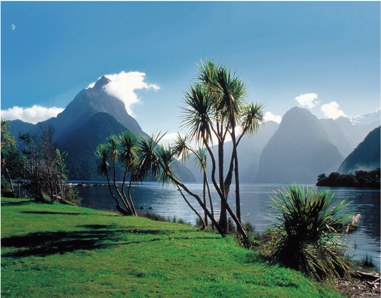
On Day 16, we see for ourselves why serene Milford Sound ranks as New Zealand’s most popular destination.

Ratings are based on the Hotel & Travel Index, the travel industry standard reference.