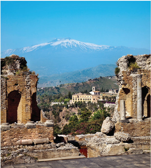
Taormina’s ancient theater overlooks Mt. Etna.

Day 11: Taormina This morning we embark on a walking tour of this delightful medieval town set on a rocky terrace overlooking the Ionian Sea. Highlights