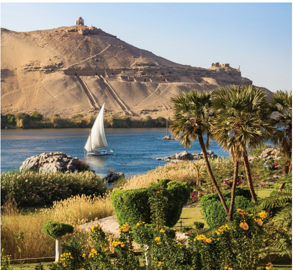
We sail traditional feluccas along the Nile.

Synagogue, built in 882. Midday we return to our hotel where tonight we enjoy a farewell dinner. B,D