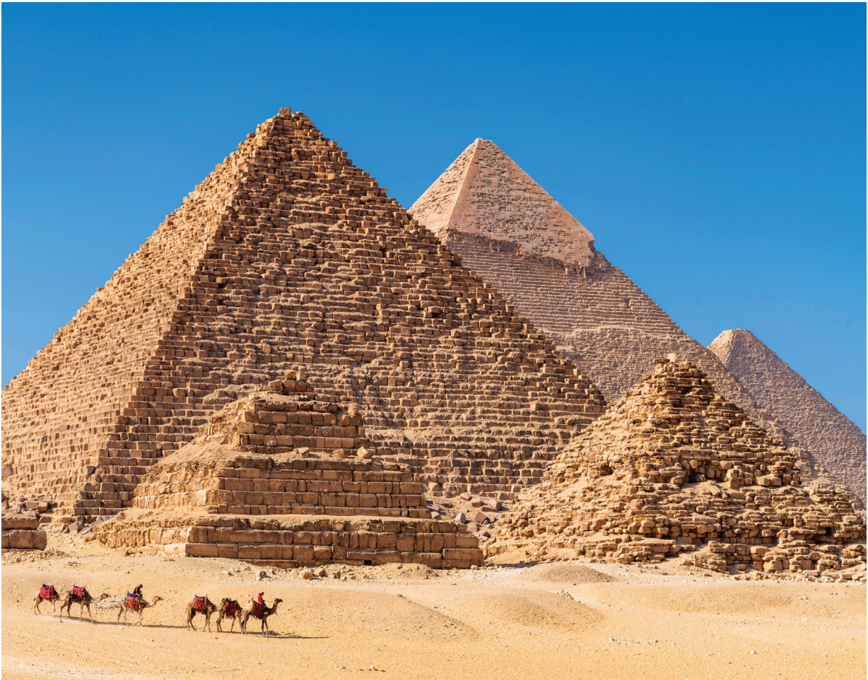
On Day 4 we travel to the Giza plateau to see the legendary pyramids, built 5,000 years ago as royal tombs.

Ratings are based on the Hotel & Travel Index, the travel industry standard reference.