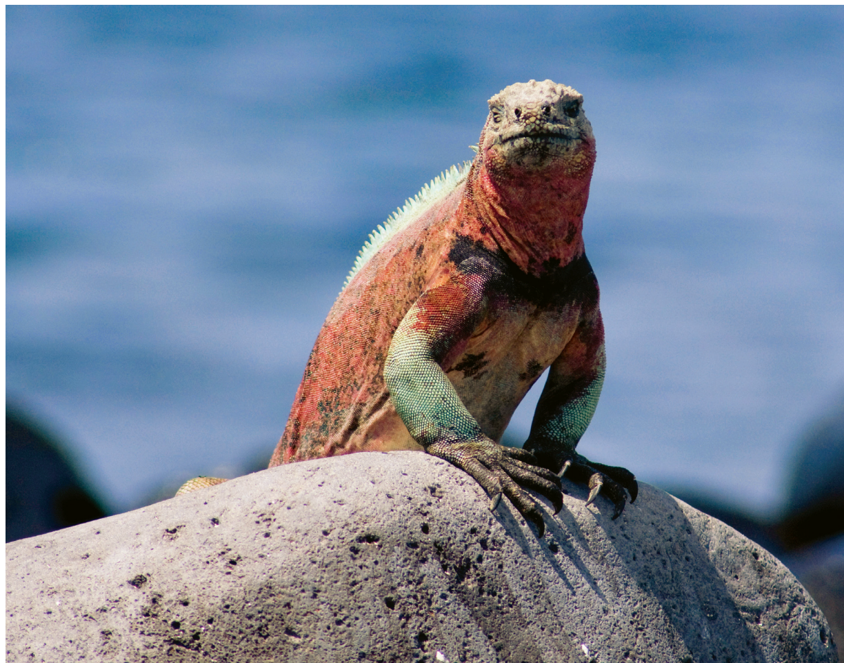
We're sure to encounter plenty of wildlife in the Galapagos, like this colorful marine iguana.

Ratings are based on the Hotel & Travel Index, the travel industry standard reference.