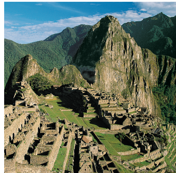
We explore the amazing ruins at Machu Picchu on Days 5 & 6.

hotel for time at leisure before tonight's transfer to the airport for our overnight flight to the U.S. B,L