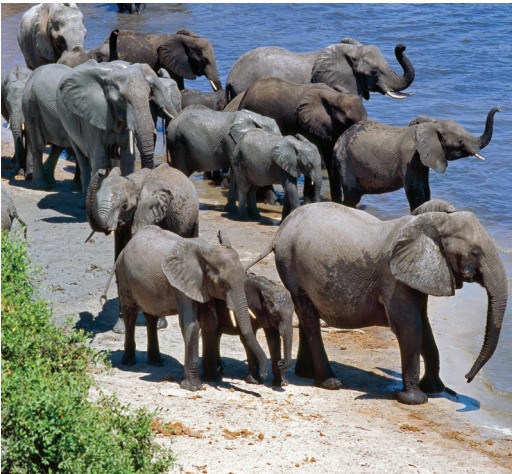
Elephants abound at Chobe.

Day 13: South Luangwa National Park/Lusaka/ Depart for U.S. We travel by charter flight today to Lusaka, Zambia’s capital, where we have hotel day