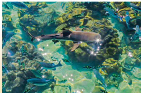
Pulau Payar Marine Park