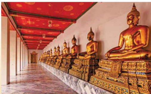
Emerald Buddha Temple, Bangkok

AHI Connects | Local Life. Engage with a Cambodian family while making rice noodles.