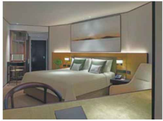
Shangri-La Singapore | Singapore