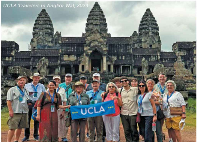
UCLA Travelers in Angkor Wat, 2023