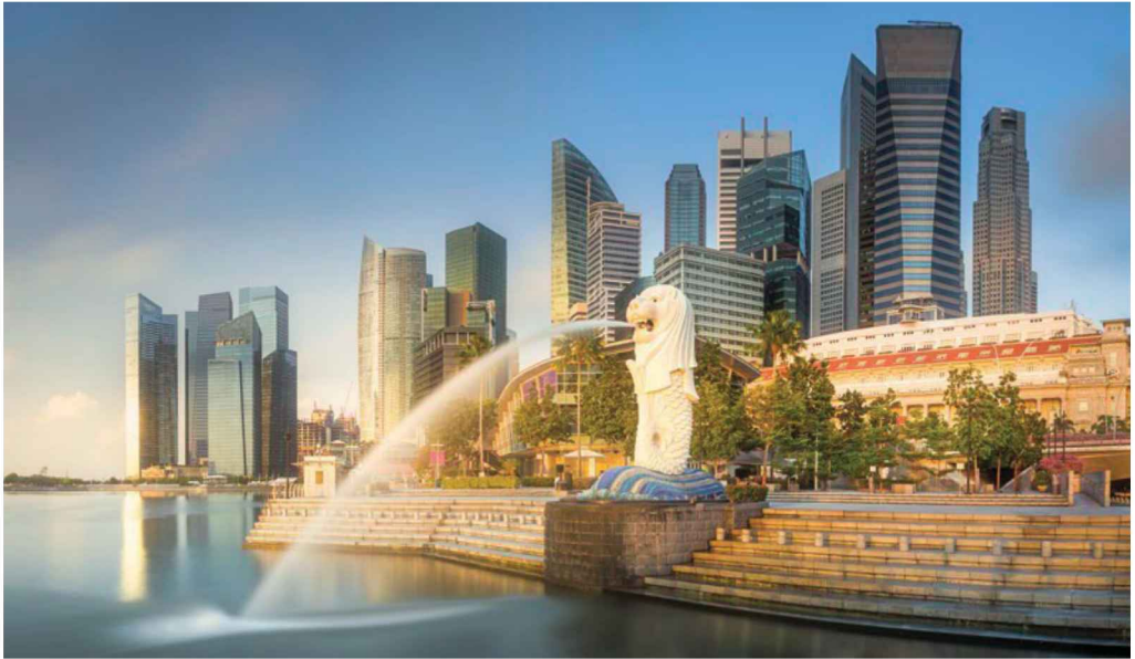
Merlion Park, Singapore