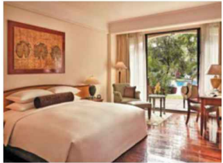
Sofitel Angkor Phokeethra Golf & Spa Resort | Siem Reap, Cambodia