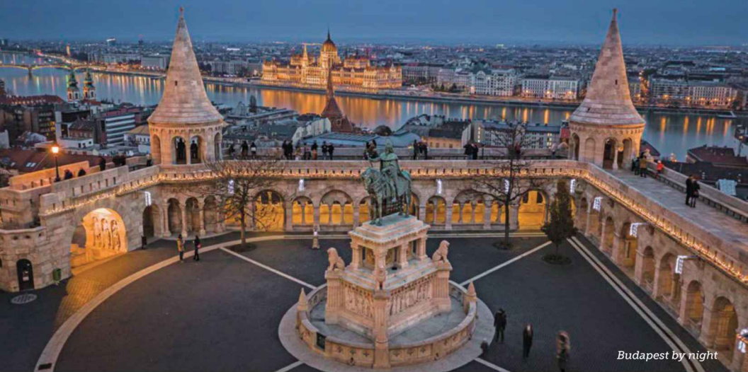
Budapest by night