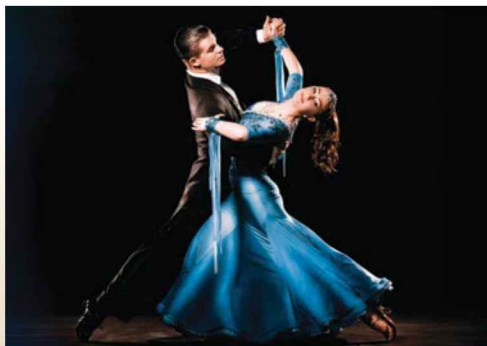
Waltz performance, Vienna