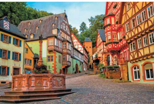
Half-timbered homes, Miltenberg