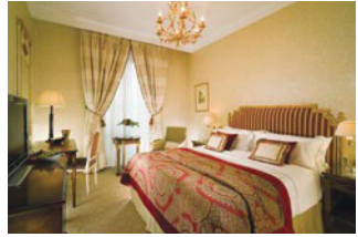
Sofia Hotel Balkan | Sofia, Bulgaria