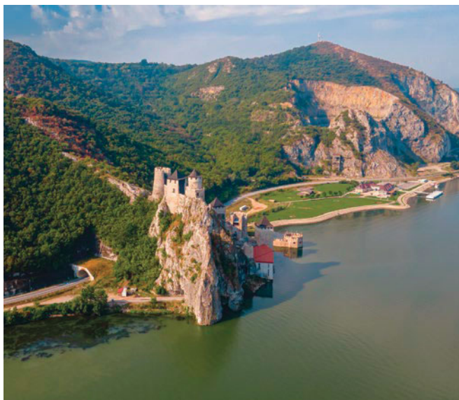
Banks of the Danube River, Serbia