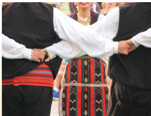
Serbian folk dancing

• Klosterneuburg Monastery & Wine. See the monastery's impressive art collection. After, visit a wine cellar for a special tasting.