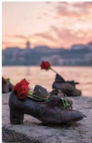
Shoes on the Danube Bank, Budapest