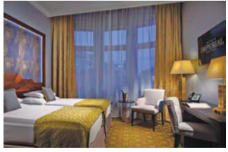
Art Deco Imperial Hotel | Prague, Czech Republic