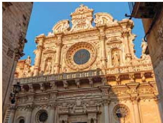
Basilica di Santa Croce, Lecce

Enrichment: History & Architecture of Lecce & Ostuni. Learn about this region's fascinating history and unique architectural styles.