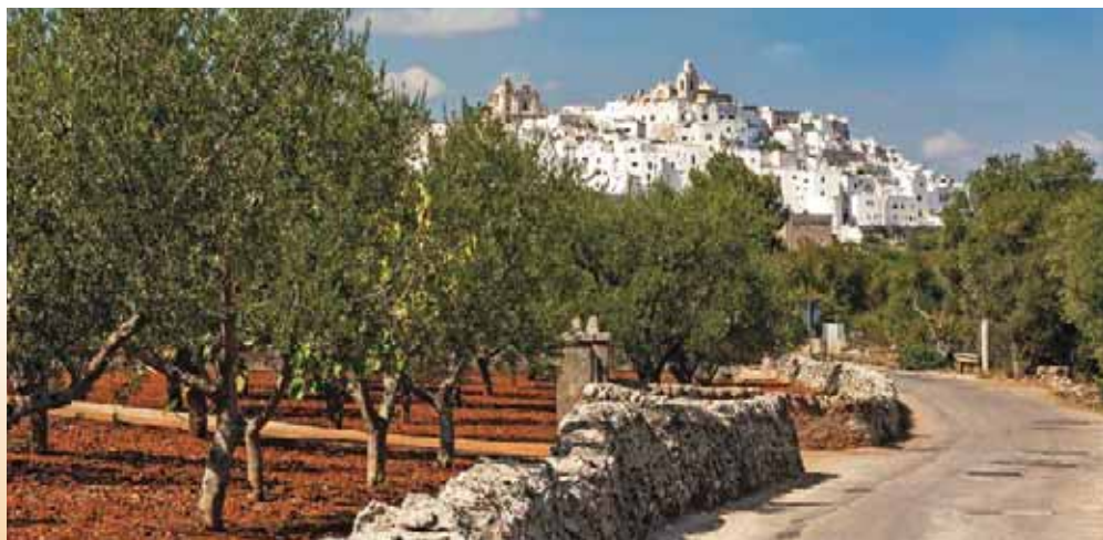
Ostuni, "The White City"

Visit a family-run olive mill in the sun-baked countryside. Learn about the history and cultivation process of olives. Unwind over lunch and gather with the mill's employees or owners to discuss life in Italy.